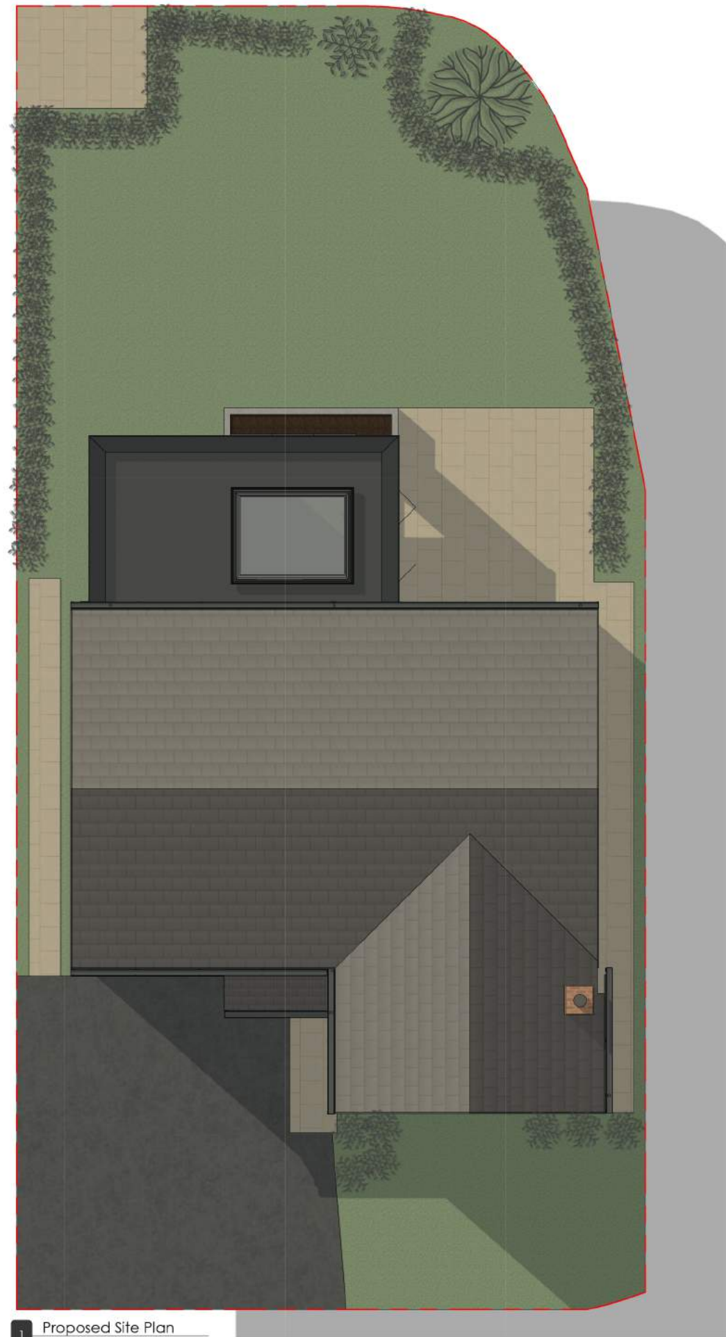
1 Proposed Site Plan 1 : 50