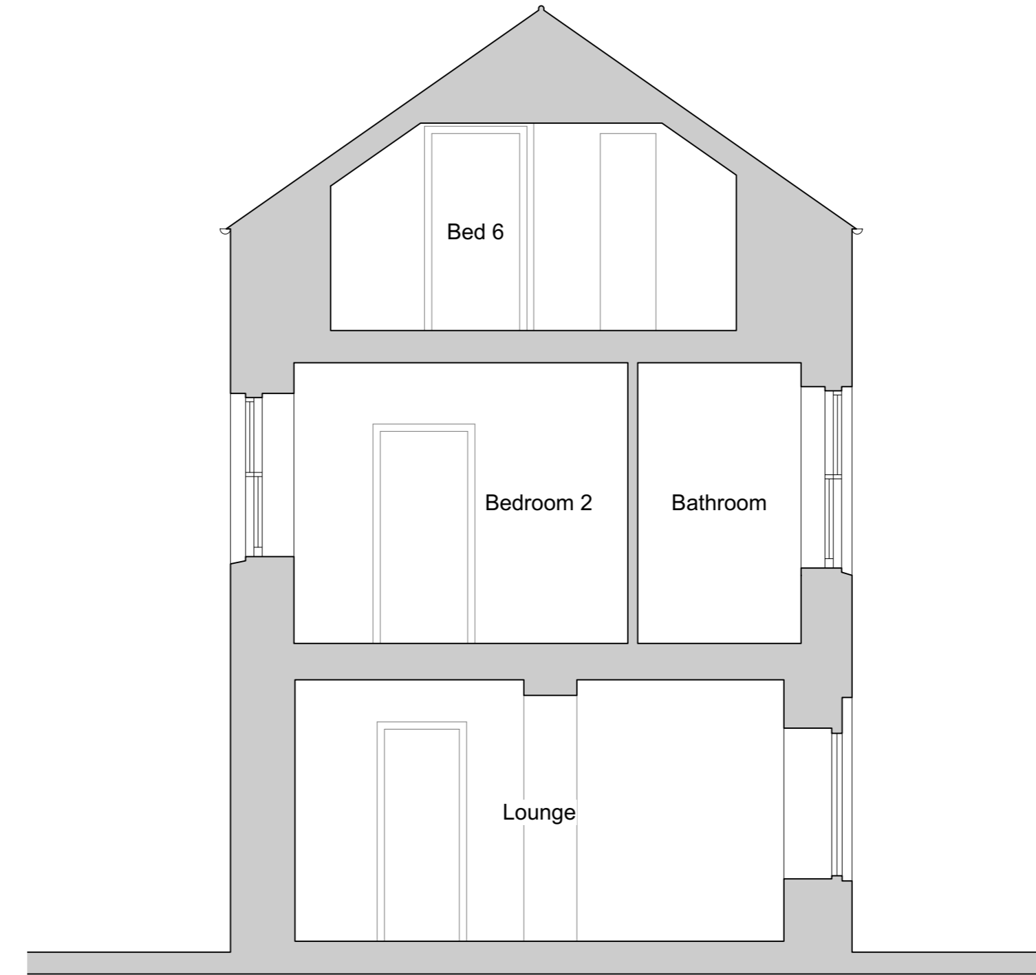
EXISTING SECTION C-C 1:50