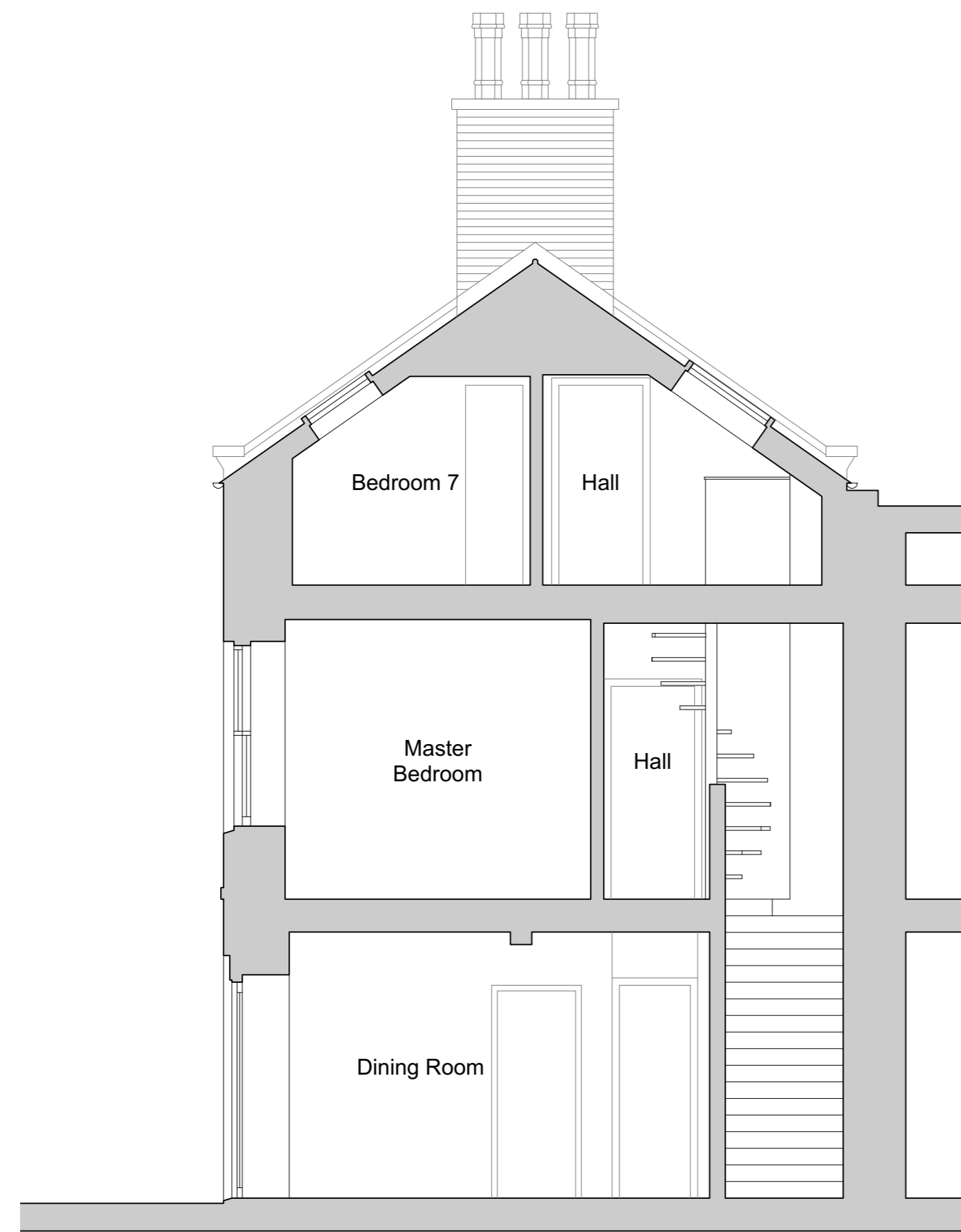
EXISTING SECTION A-A 1:50

Basement not surveyed. No external access to South and West Elevations, these are therefore indicative, based on internal survey information.