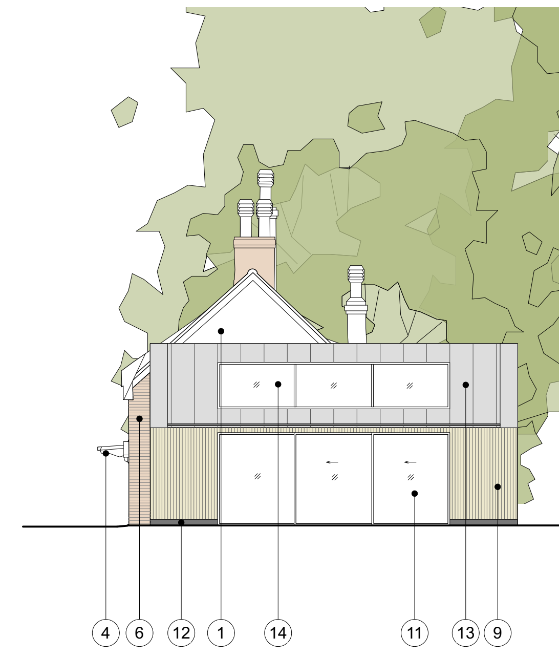
2 North East Elevation (Proposed) Scale: 1:100