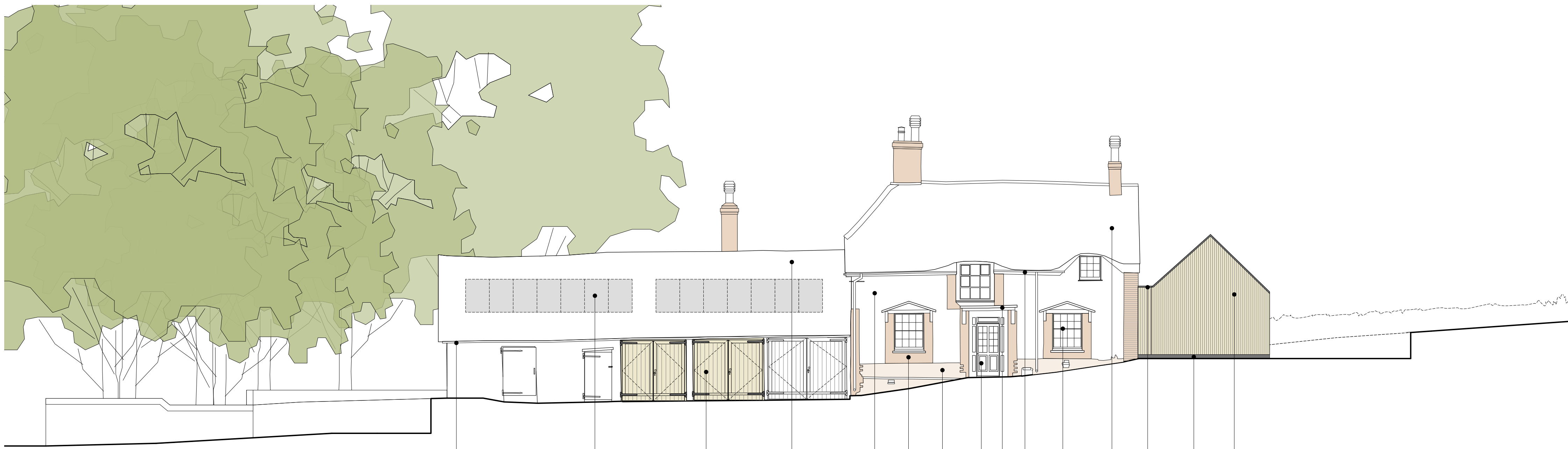
1 South East Elevation (Proposed) Scale: 1:100