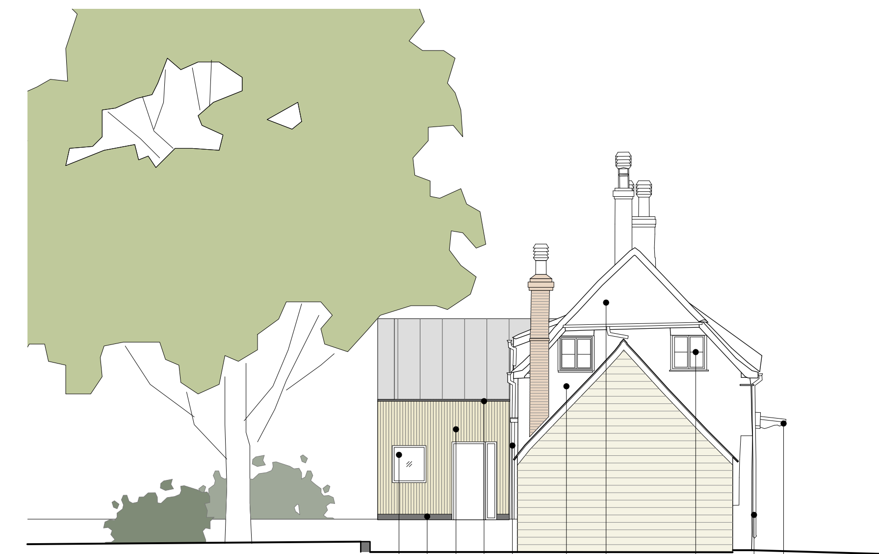
4 South West Elevation (Proposed) Scale: 1:100