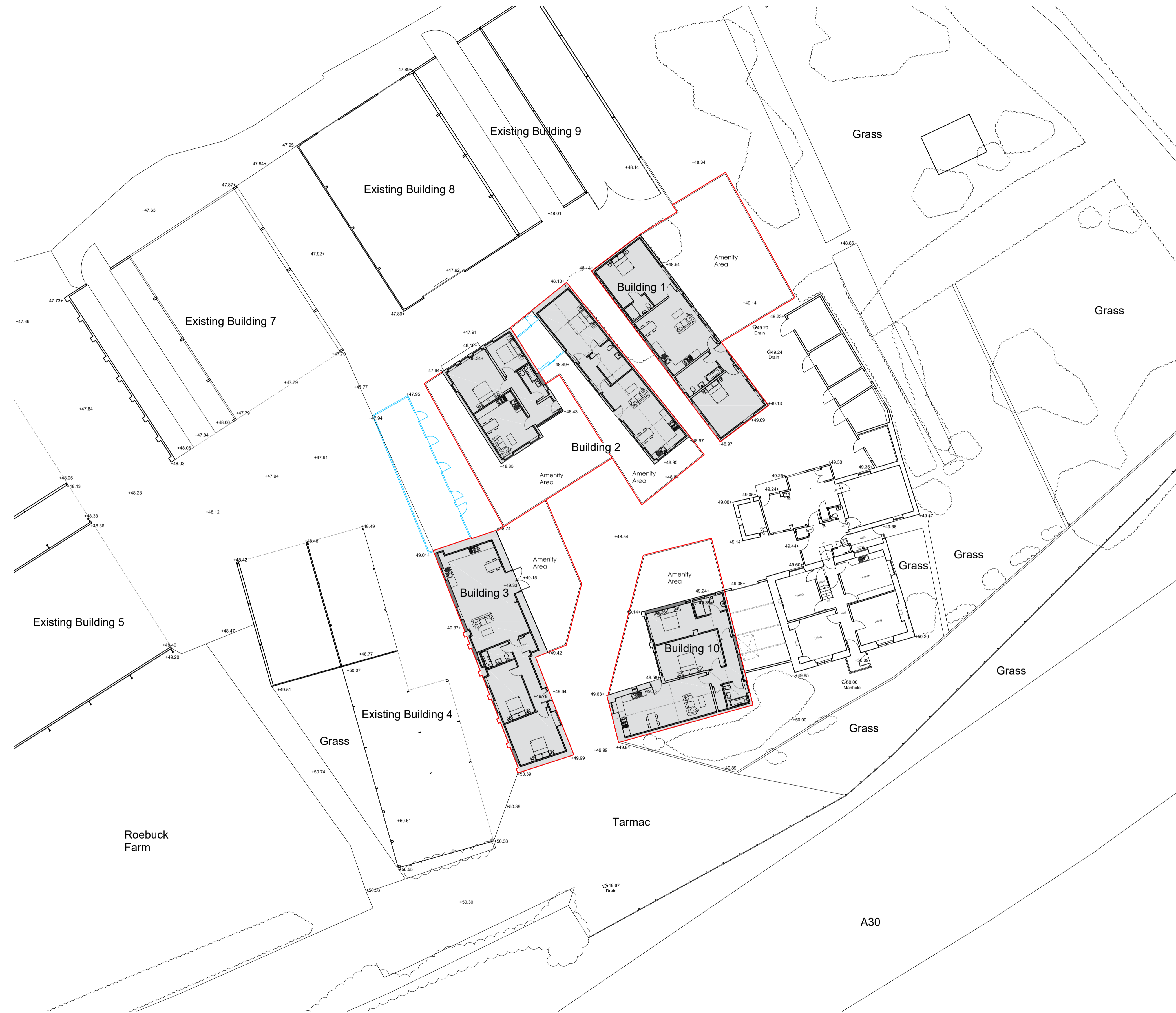
PROPOSED CURTILAGE PLAN 1:200