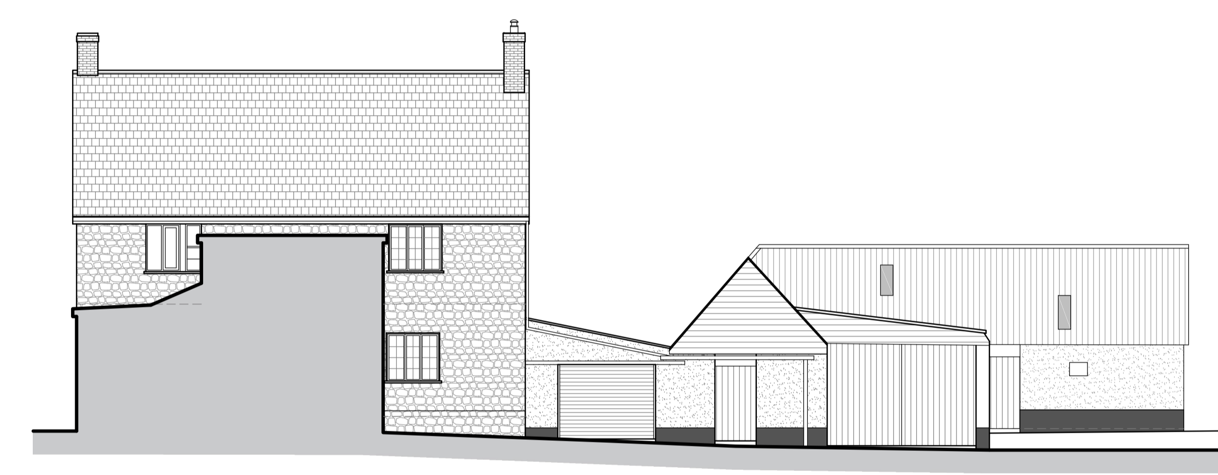
EXISTING NORTH ELEVATION 1:100