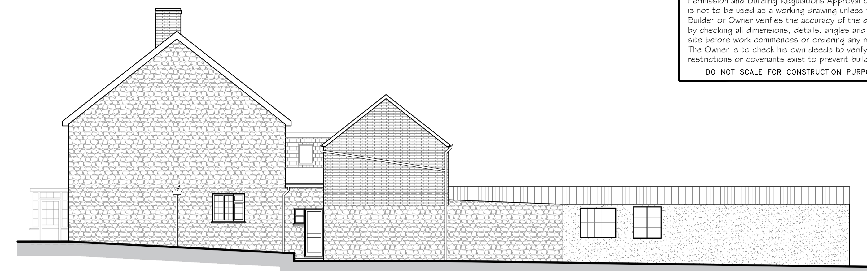
EXISTING EAST ELEVATION 1:100