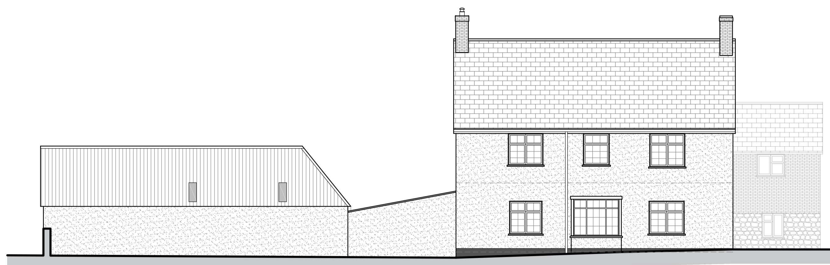
EXISTING SOUTH ELEVATION 1:100

IMPORTANT NOTES: Any discrepancies must be reported to ARA Architecture before proceeding. Figured dimensions only are to be worked from. This drawing remains the copyright of ARA Architecture. This drawing is supplied in order to gain Planning Permission and Building Regulations Approval only and is not to be used as a working drawing unless the Builder or Owner verifies the accuracy of the drawings by checking all dimensions, details, angles and notes on site before work commences or ordering any materials. The Owner is to check his own deeds to verify that no restrictions or covenants exist to prevent building. DO NOT SCALE FOR CONSTRUCTION PURPOSES