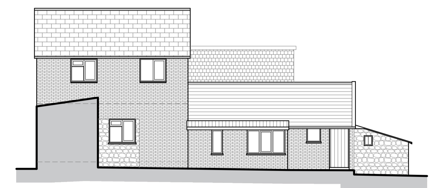
EXISTING NORTH ELEVATION 1:100