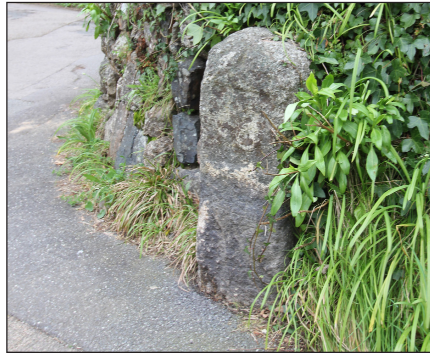
Fig. 2. Detailed Photographs of Boundary Stone at St Clare