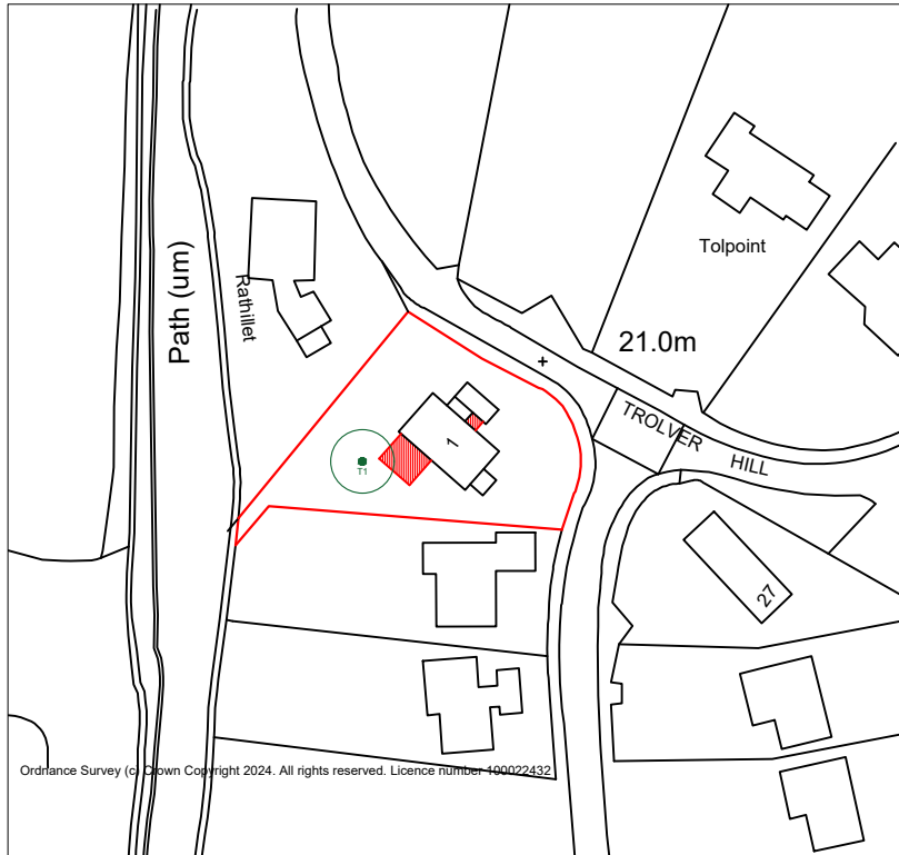
Location plan (1:1250)