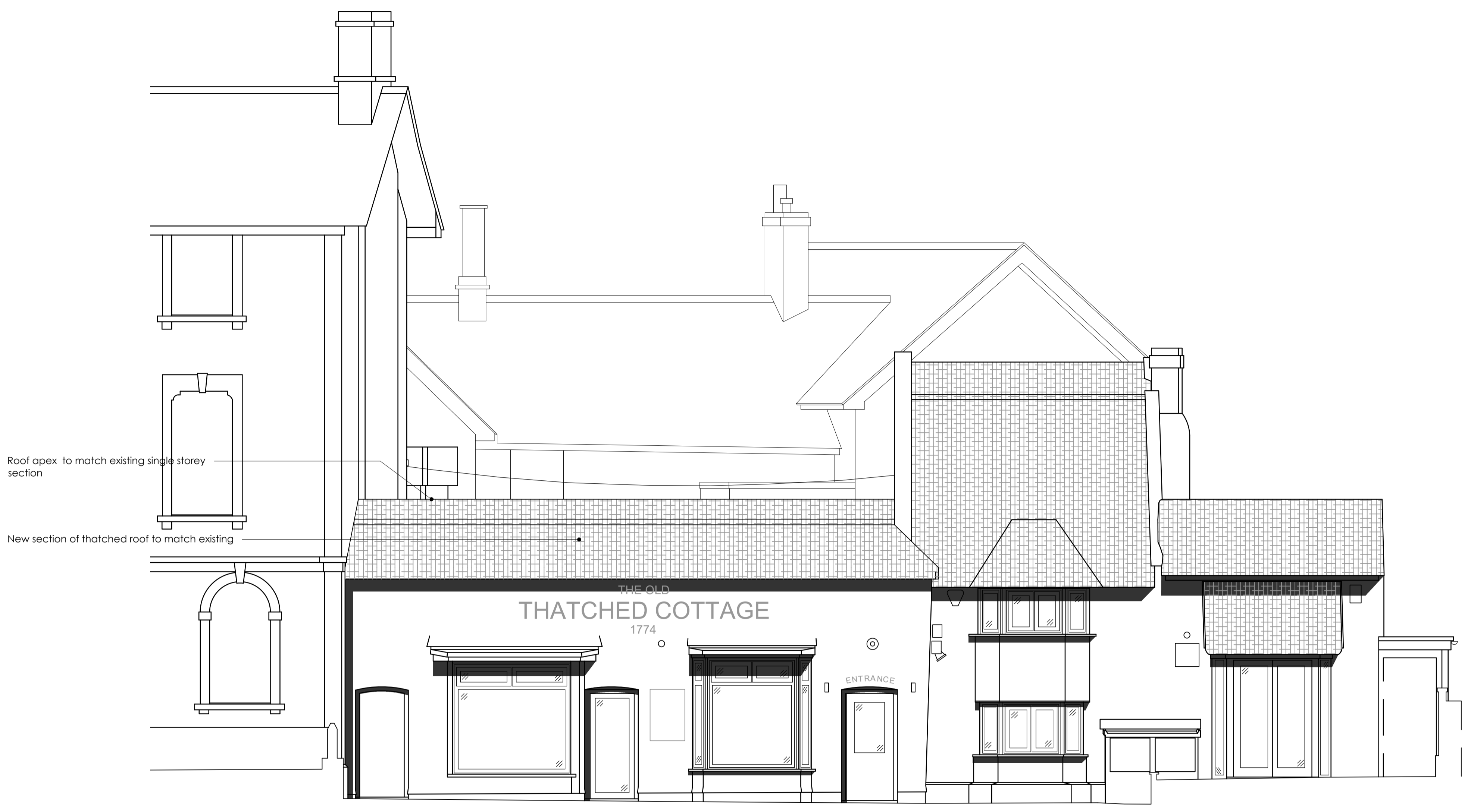
A - Proposed Elevation Scale: 1:50