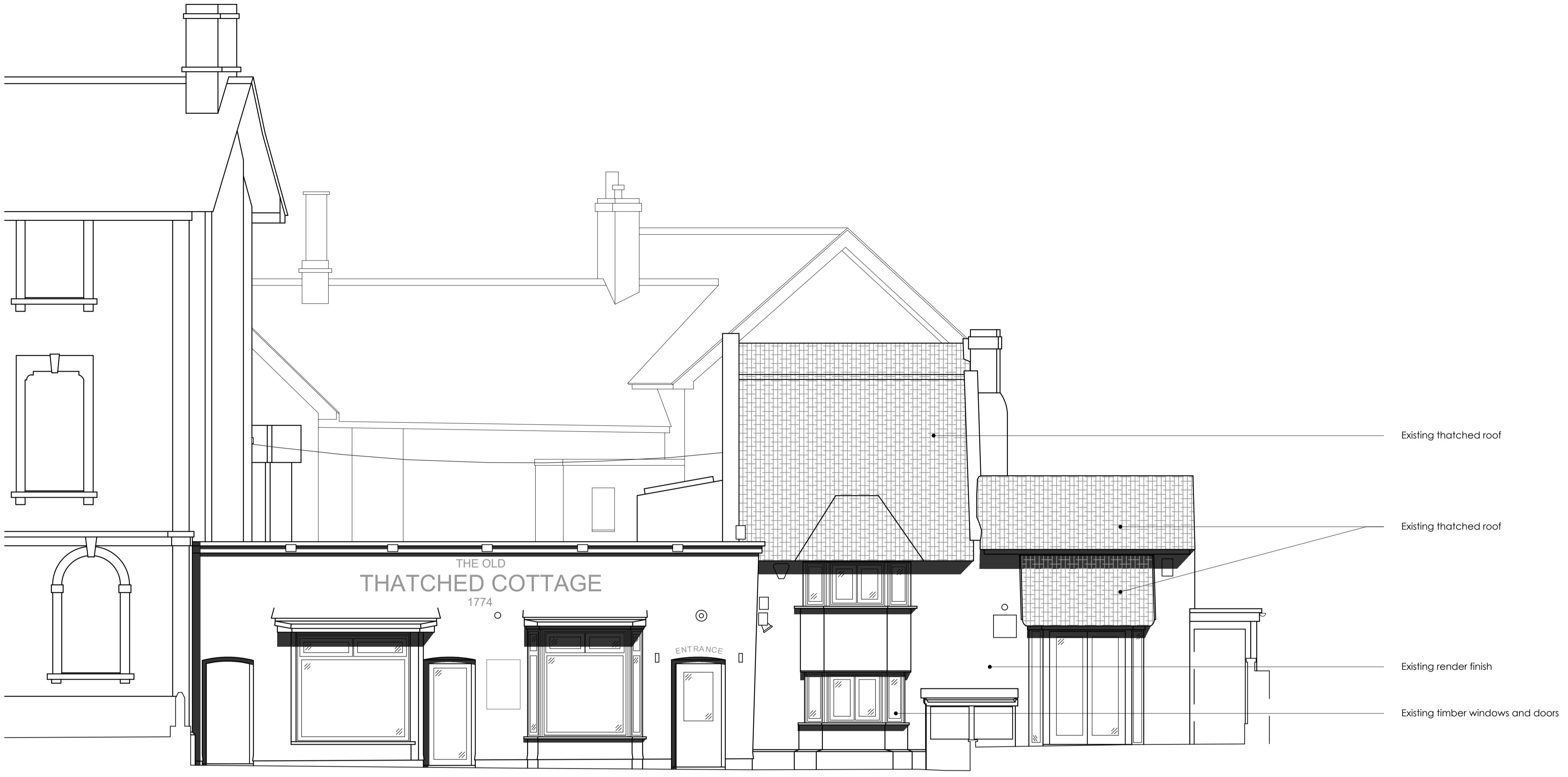
A - Existing Elevation Scale: 1:50