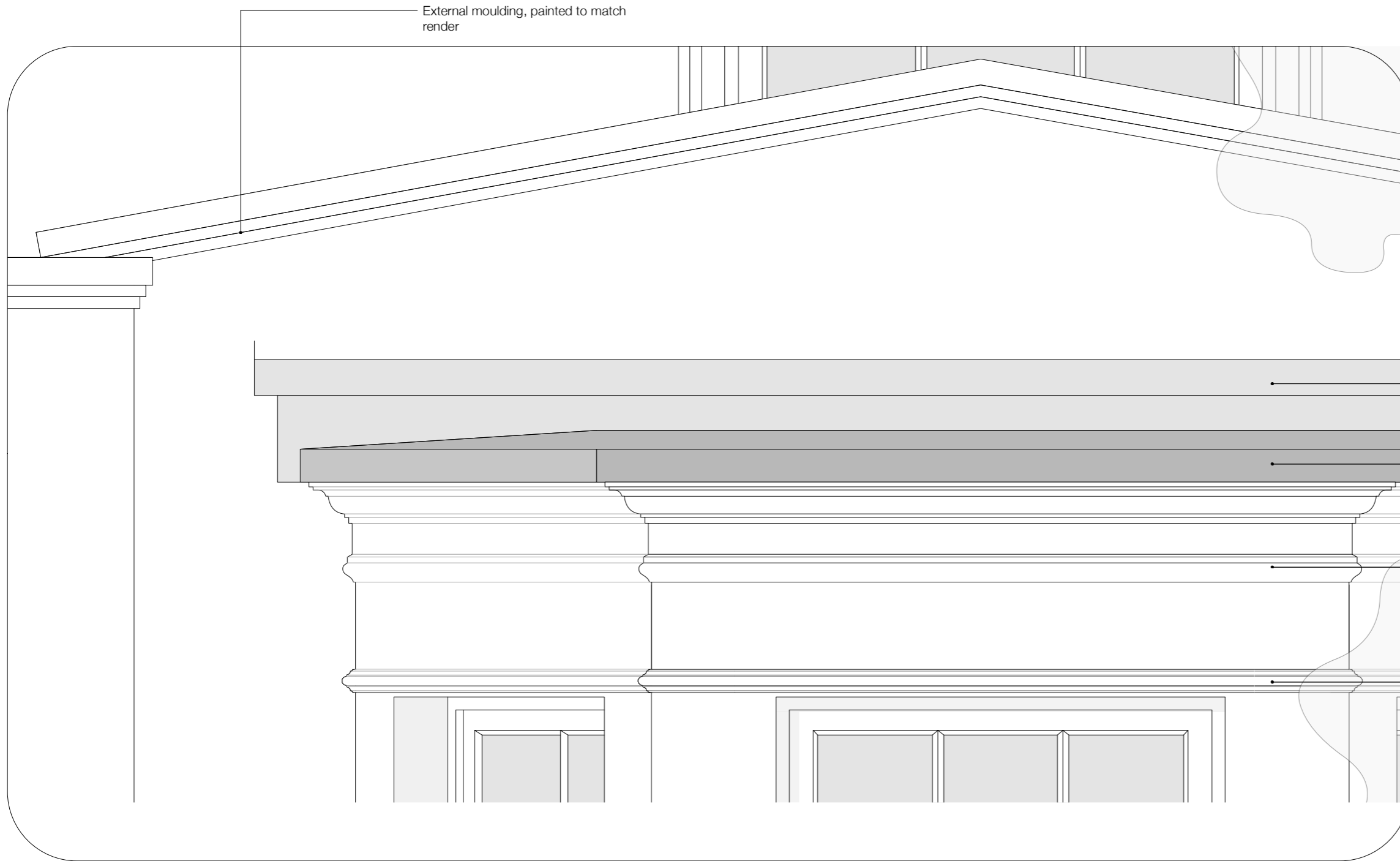
ELEVATION OF DECORATIVE DETAILS TO BAY WINDOW