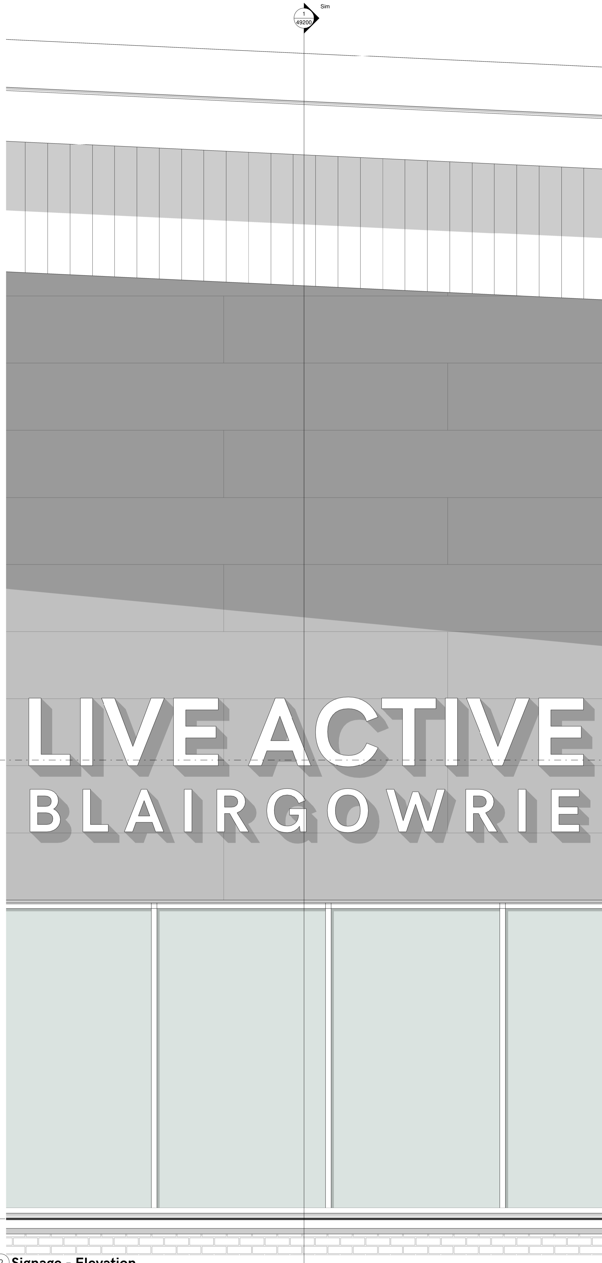
2 Signage - Elevation 1:20