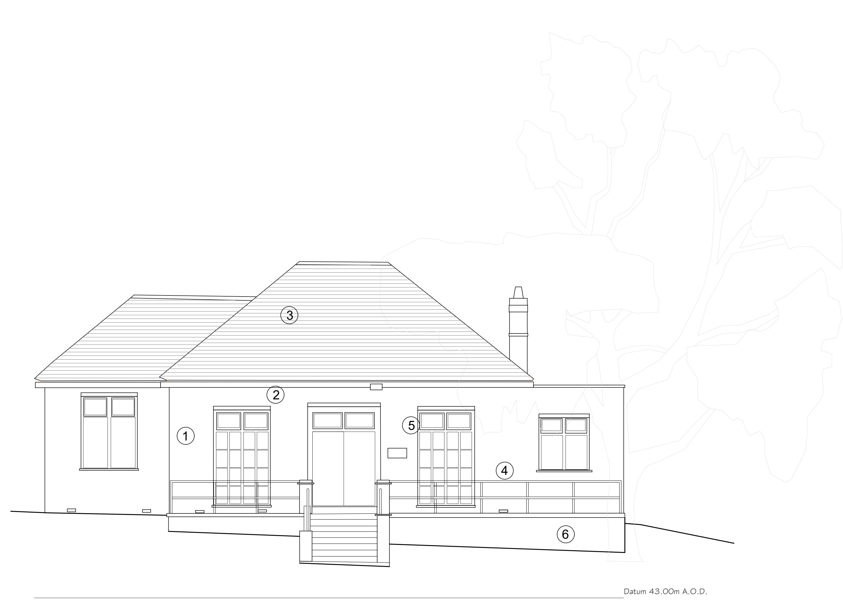
Existing Sons of Rest Elevation C