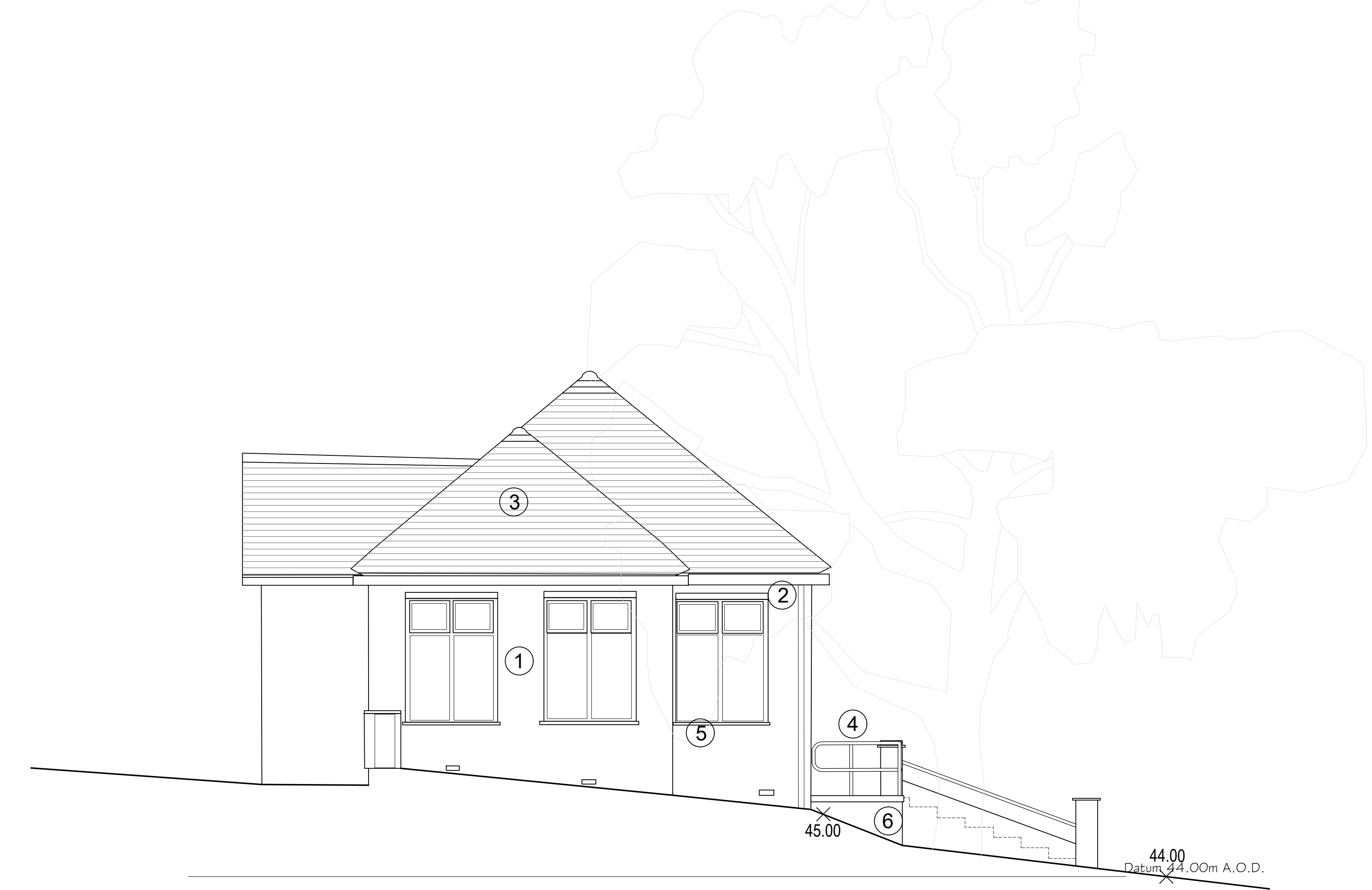
Existing Sons of Rest Elevation B