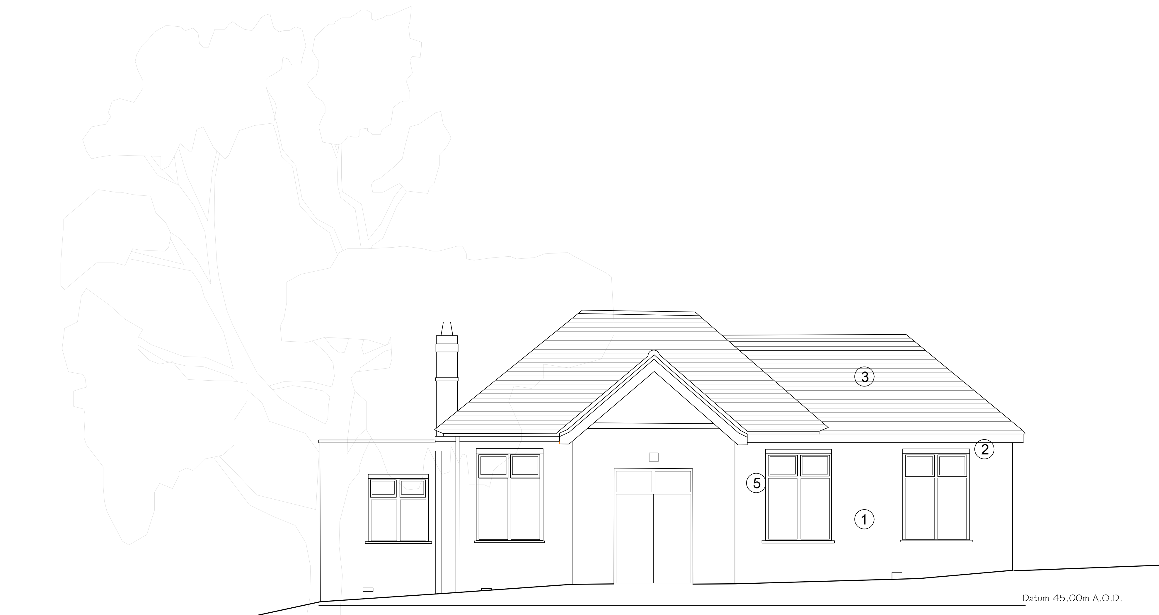
Existing Sons of Rest Elevation A