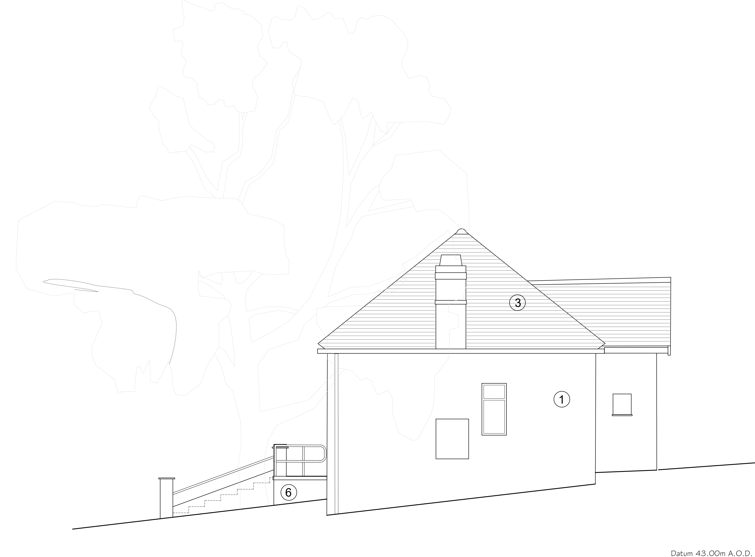
Existing Sons of Rest Elevation D