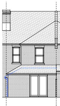
5 proposed N-W (rear) elevation Scale: 1:100