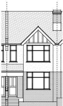
4 proposed S-E (front) elevation Scale: 1:100