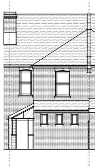
2 existing N-W (rear) elevation Scale: 1:100