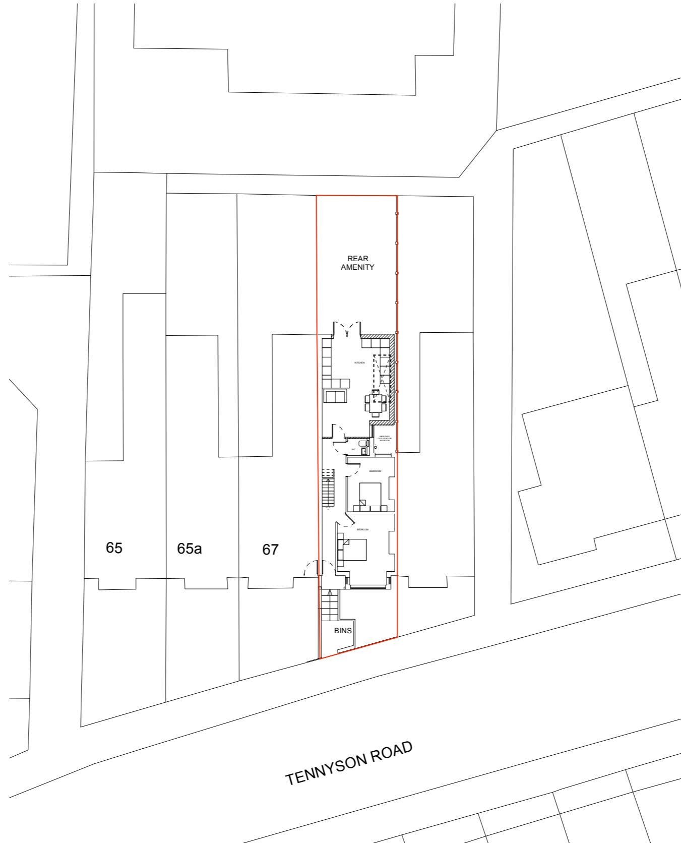
2 proposed site plan Scale: 1:250