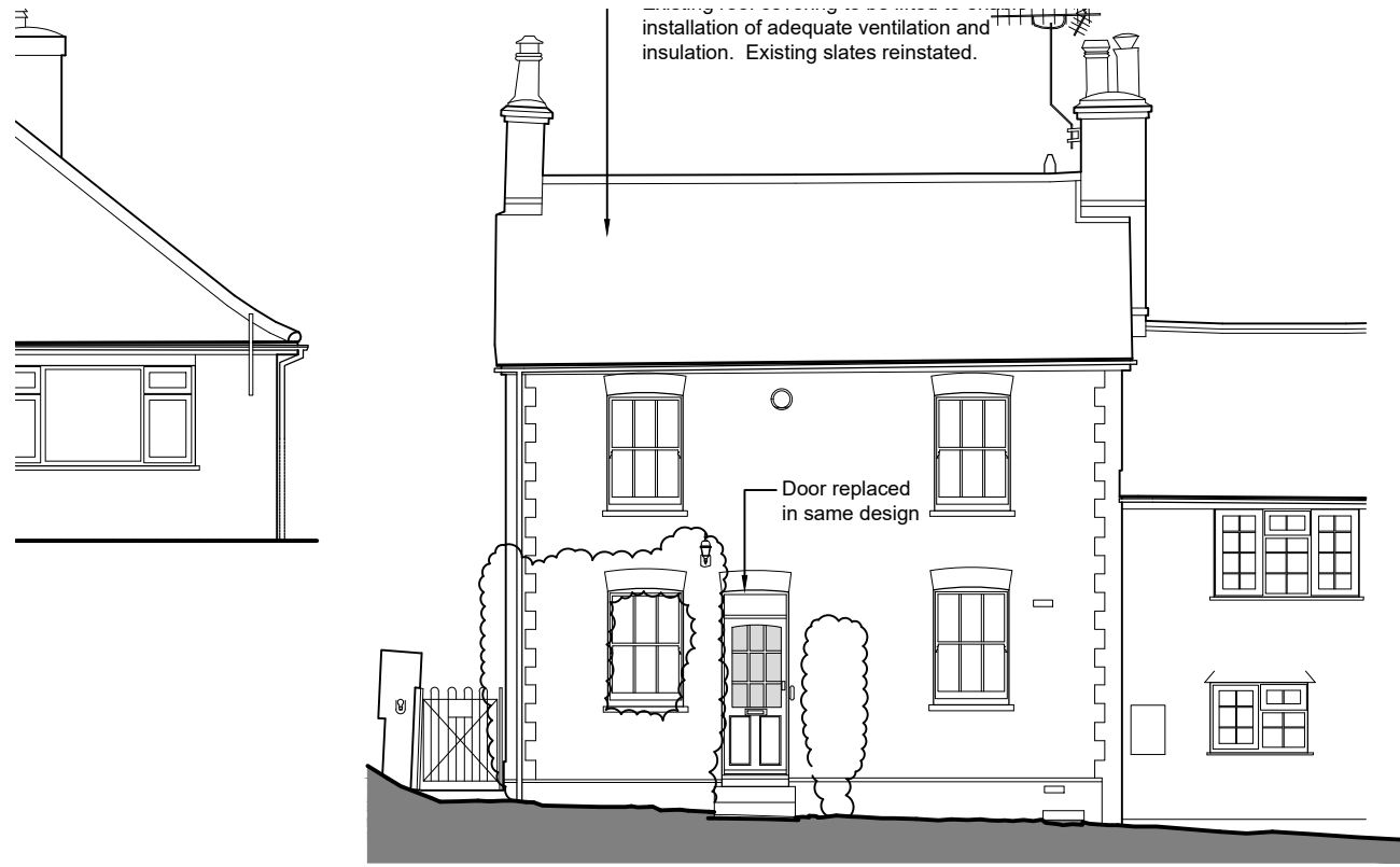
FRONT (WEST) ELEVATION