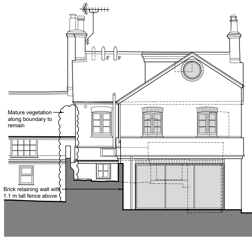
REAR (EAST) ELEVATION