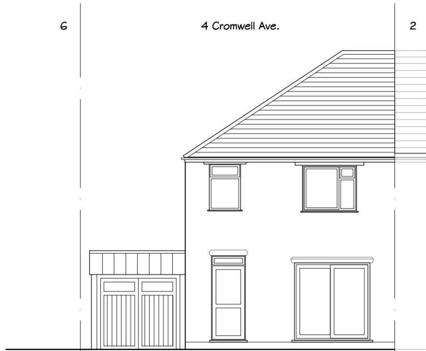
Existing Rear Elevation Scale : 1/100@A3