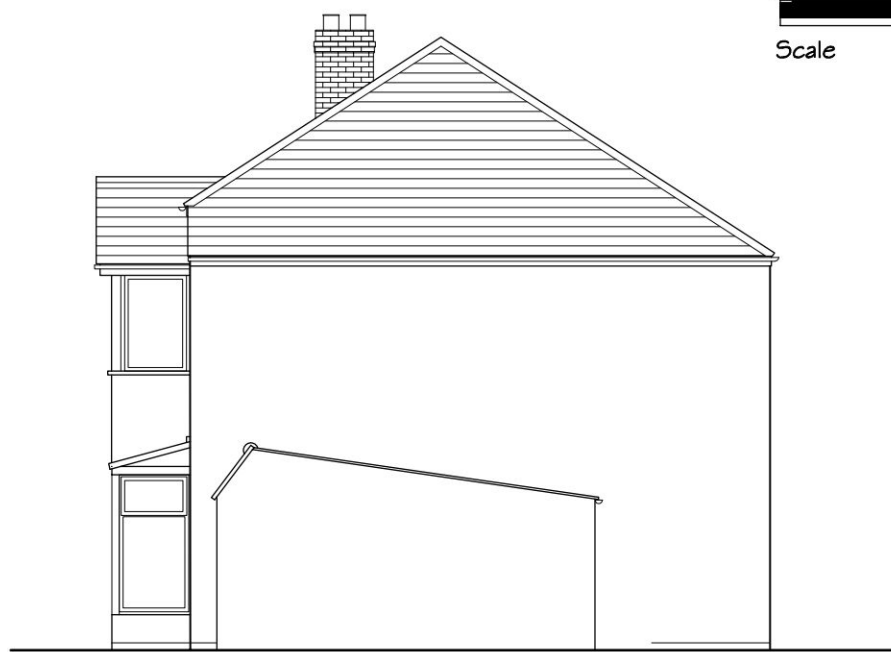
Existing Right Elevation Scale : 1/100@A3