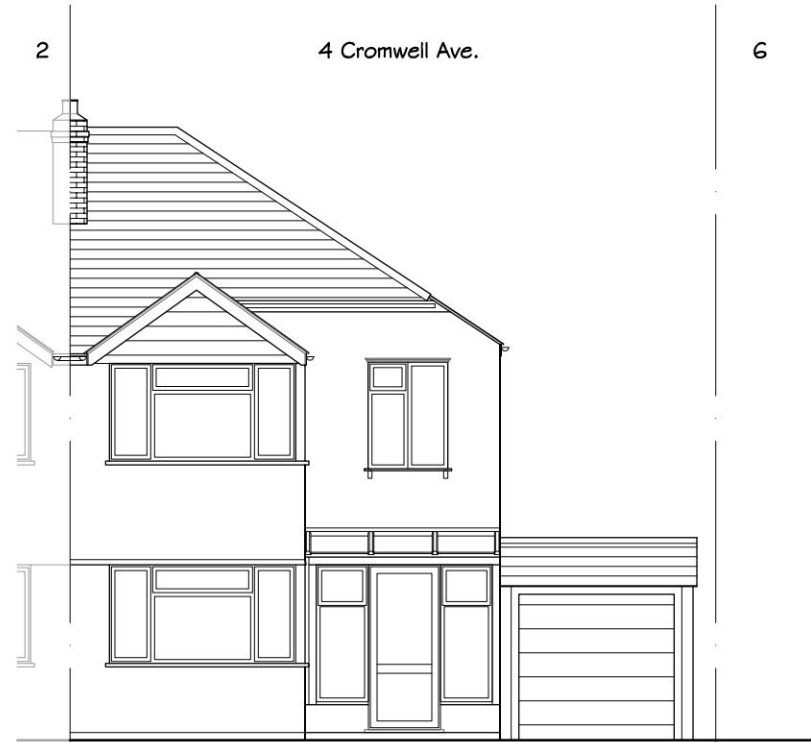
Existing Front Elevation Scale : 1/100@A3