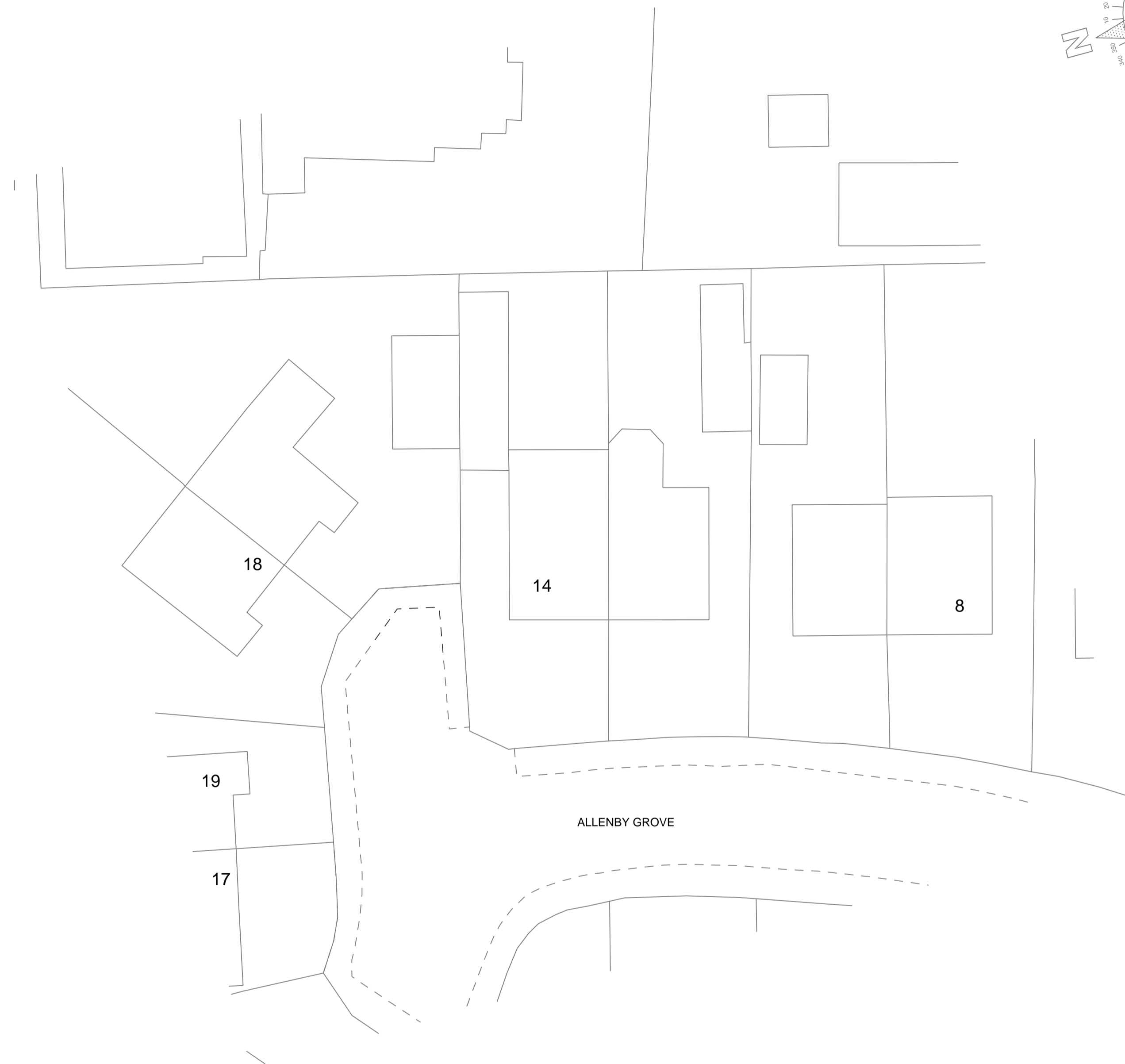
EXISTING SITE LAYOUT