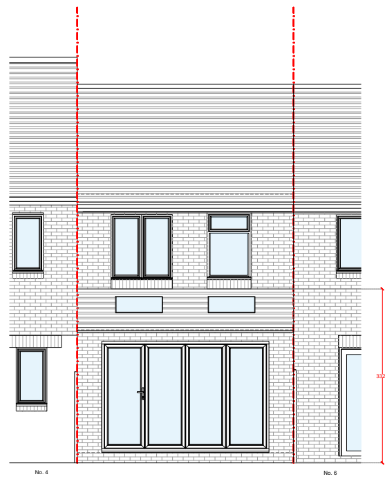
(A) PROPOSED ELEVATION A

GENERAL NOTES: This drawing is for information purposes only. Intended to the individual or entity to whom it is addressed. Distribution or copying of this drawings is strictly prohibited. 1. All dimension are in millimeters. All dimensions and levels to be checked on site. The Architect to be notified of any discrepancies. 2. Drawings should be printed at 1:1 page size A3. To scale from the drawing use the scale bar provided. 3. All works if applicable, must comply with current Building and Water Regulations. 4. The contractor has ensured, during demolition work, no distress or movement to walls, floors and roof to the subject and adjoining building. 5. All structural concrete to be grade C35 UNO 6. All Structural steel to be grade S275 UNO. 7. All Steel to be covered with 2 layers of 12.5mm plasterboard to achieve 30 min fire resistance. 8. All supporting walls and structural works to be read in conjunction with structural engineer's details. structural steelwork (where used) to meet current building regulations.