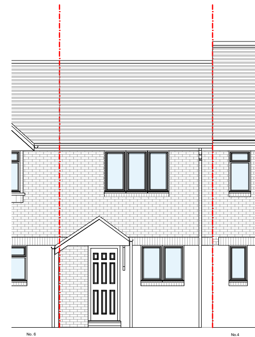
C EXISTING ELEVATION C