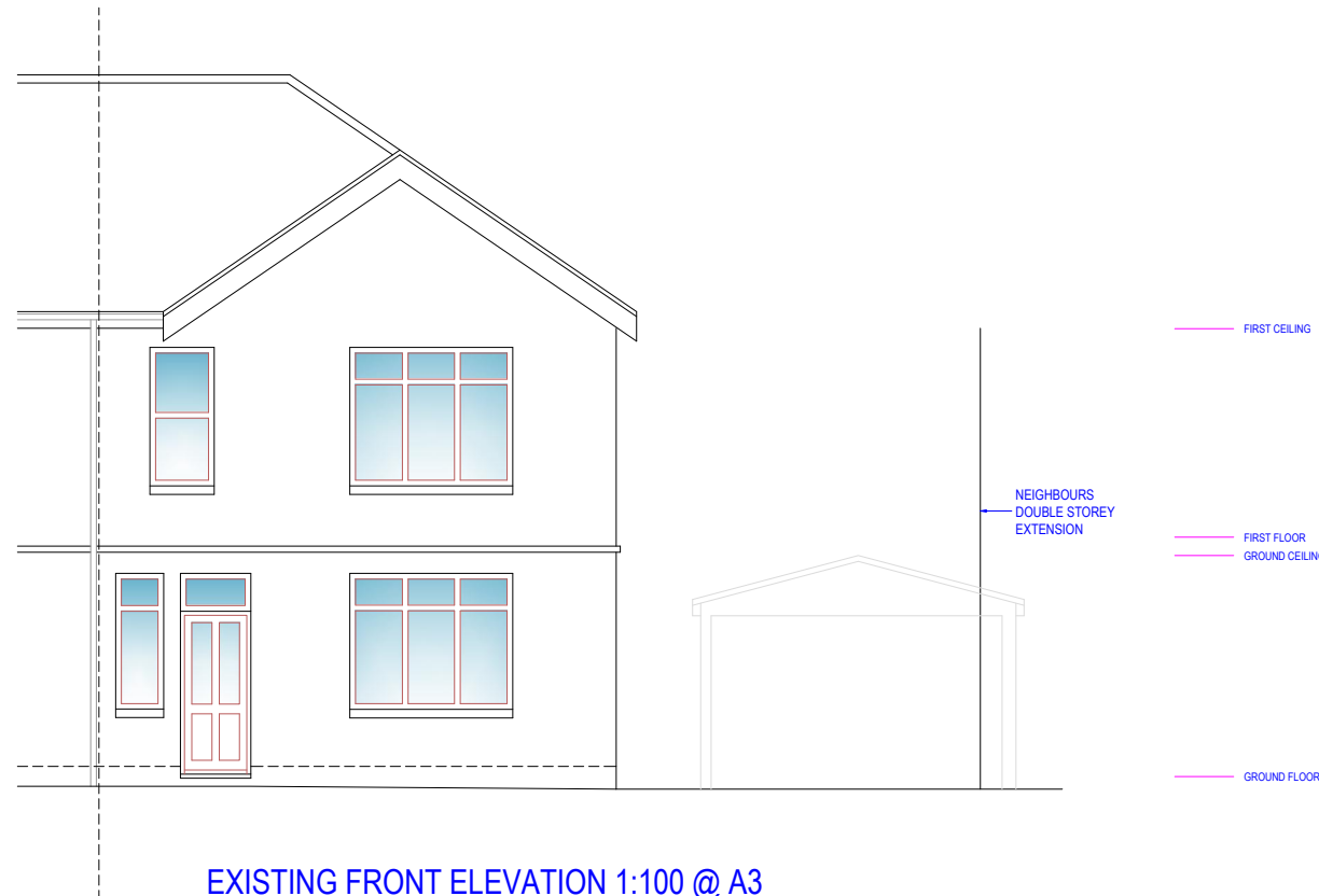
EXISTING FRONT ELEVATION 1:100 @ A3