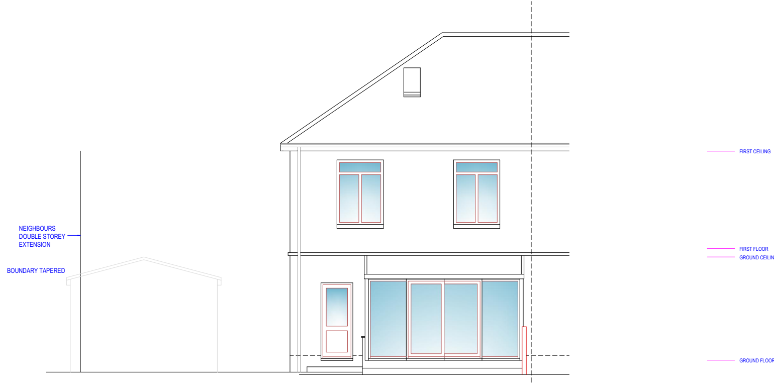
EXISTING REAR ELEVATION 1:100 @ A3