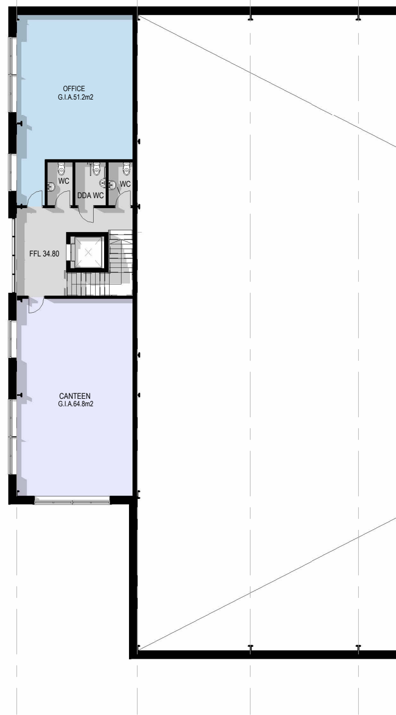
First Floor Level 1 : 200