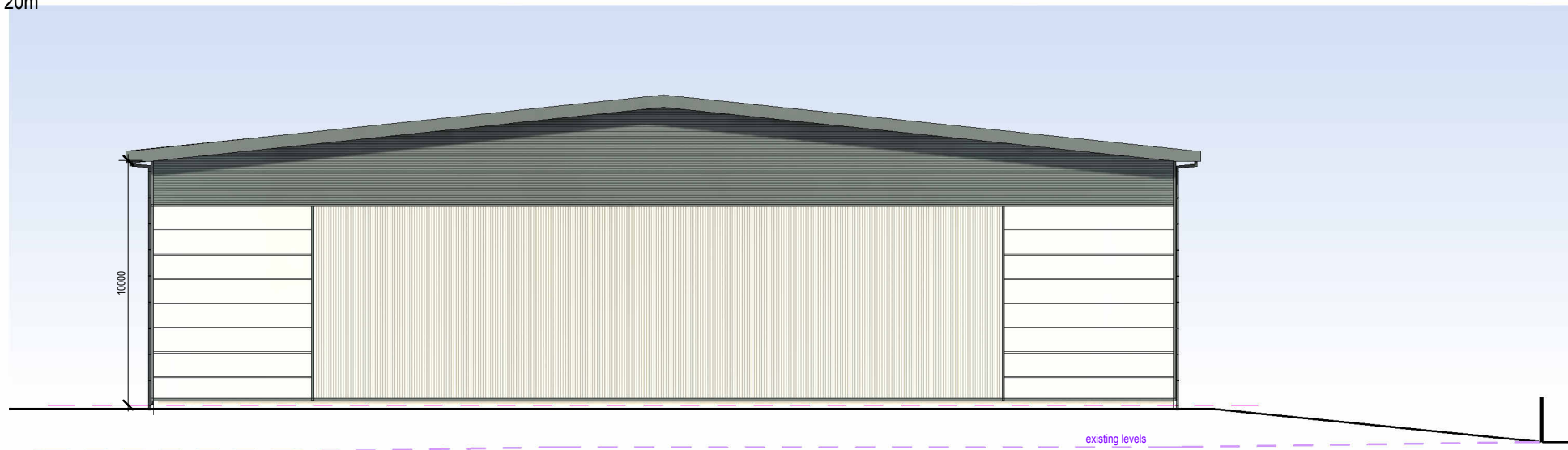
Rear - east - elevation 1 : 250