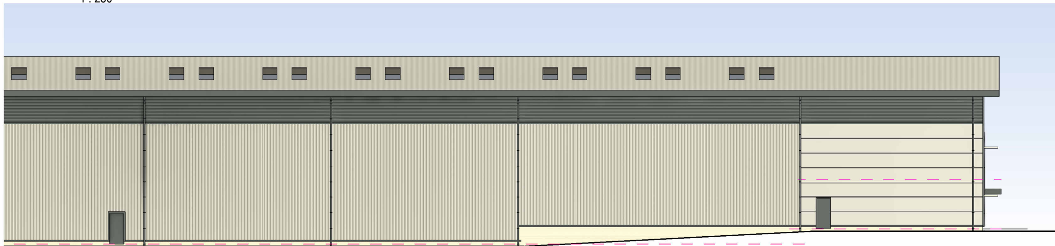
continuation side - north - elevation 1 : 250