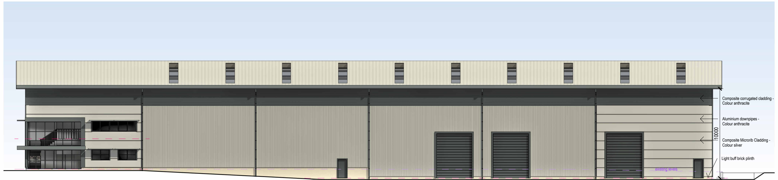
Entrance - south - elevation 1 : 250