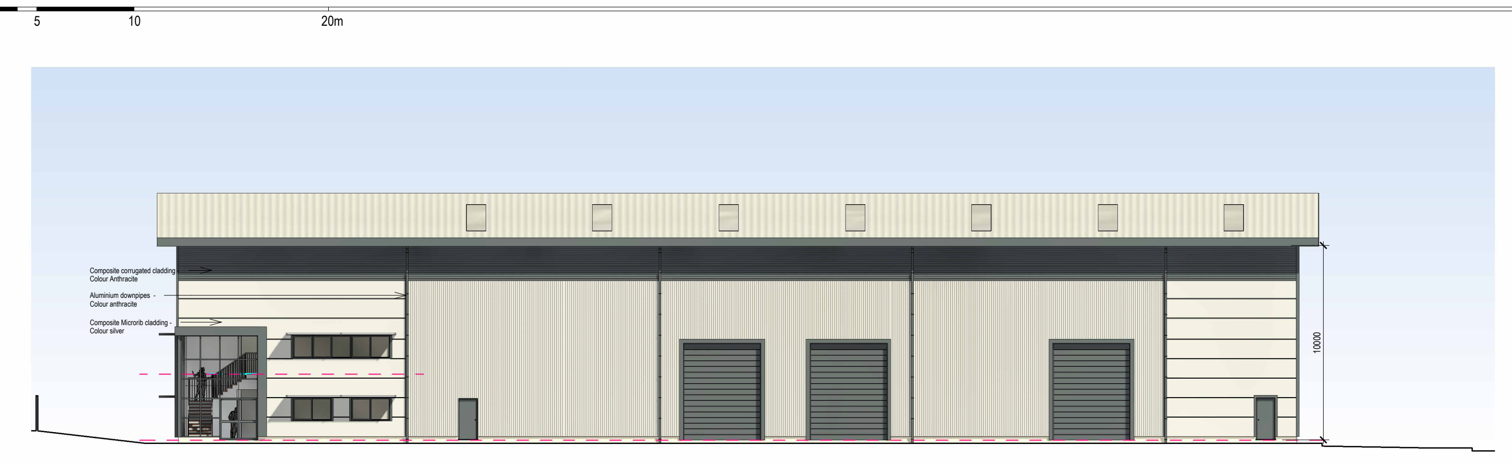
Front - south - elevation 1:200