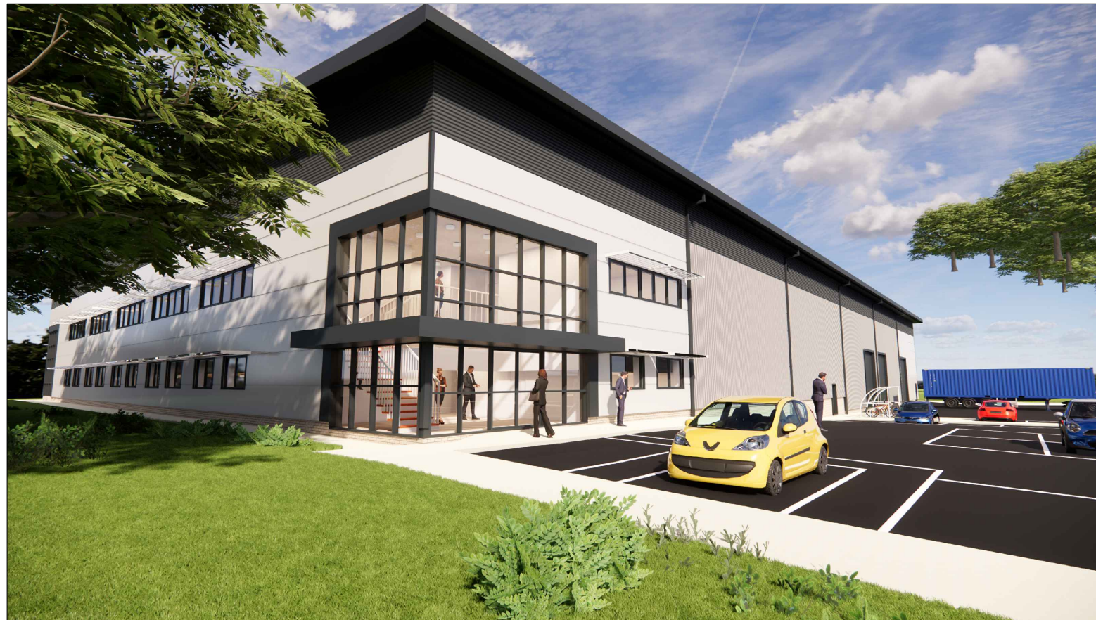
UNIT 3 - proposed view 1