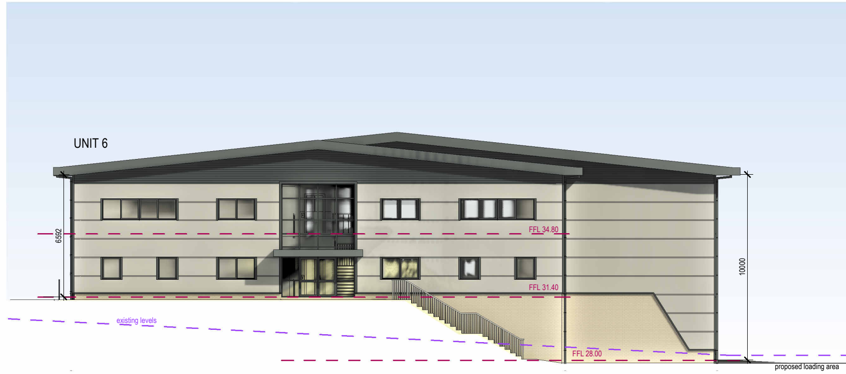
Proposed front -west - elevation 1 : 200