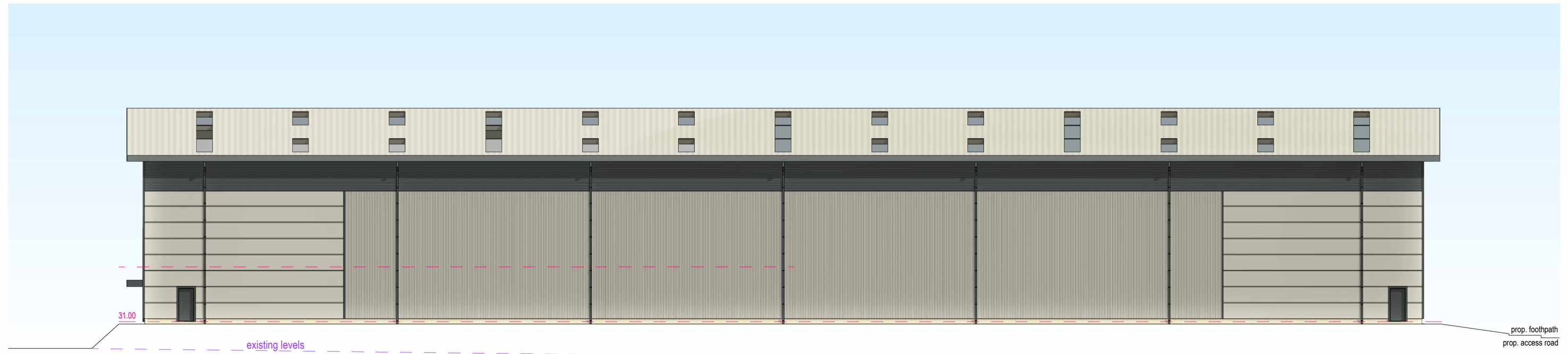
Rear - south - elevation 1 : 250