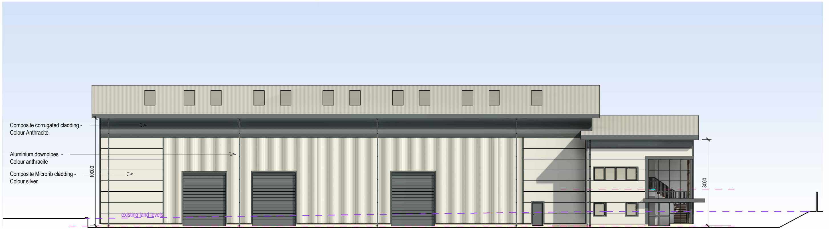
Entrance - north - elevations 1 : 200