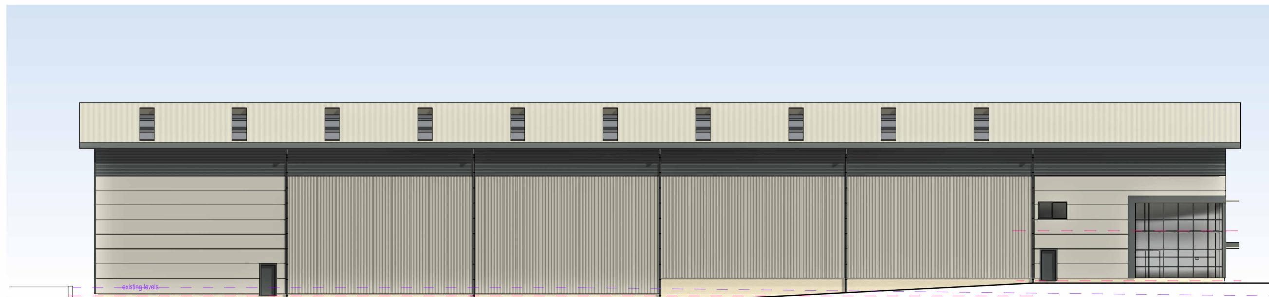
Rear - north - elevation 1 : 250