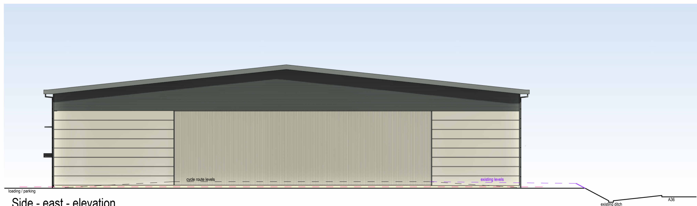
Side - east - elevation 1 : 250