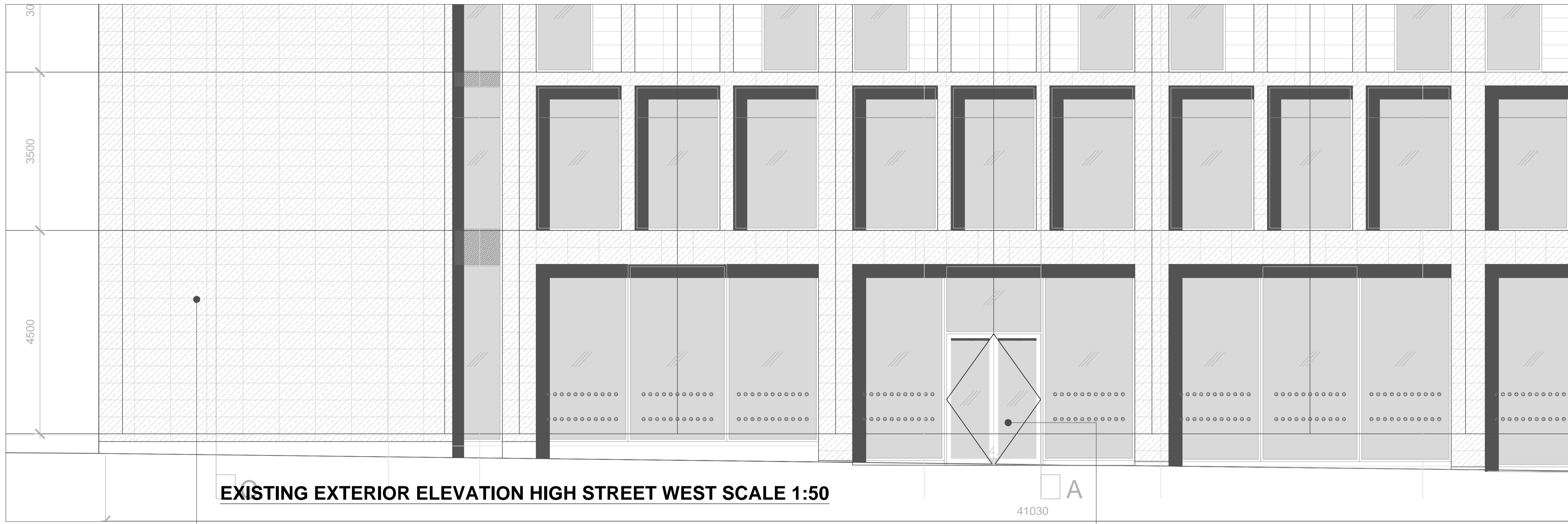
EXISTING EXTERIOR ELEVATION HIGH STREET WEST SCALE 1:50