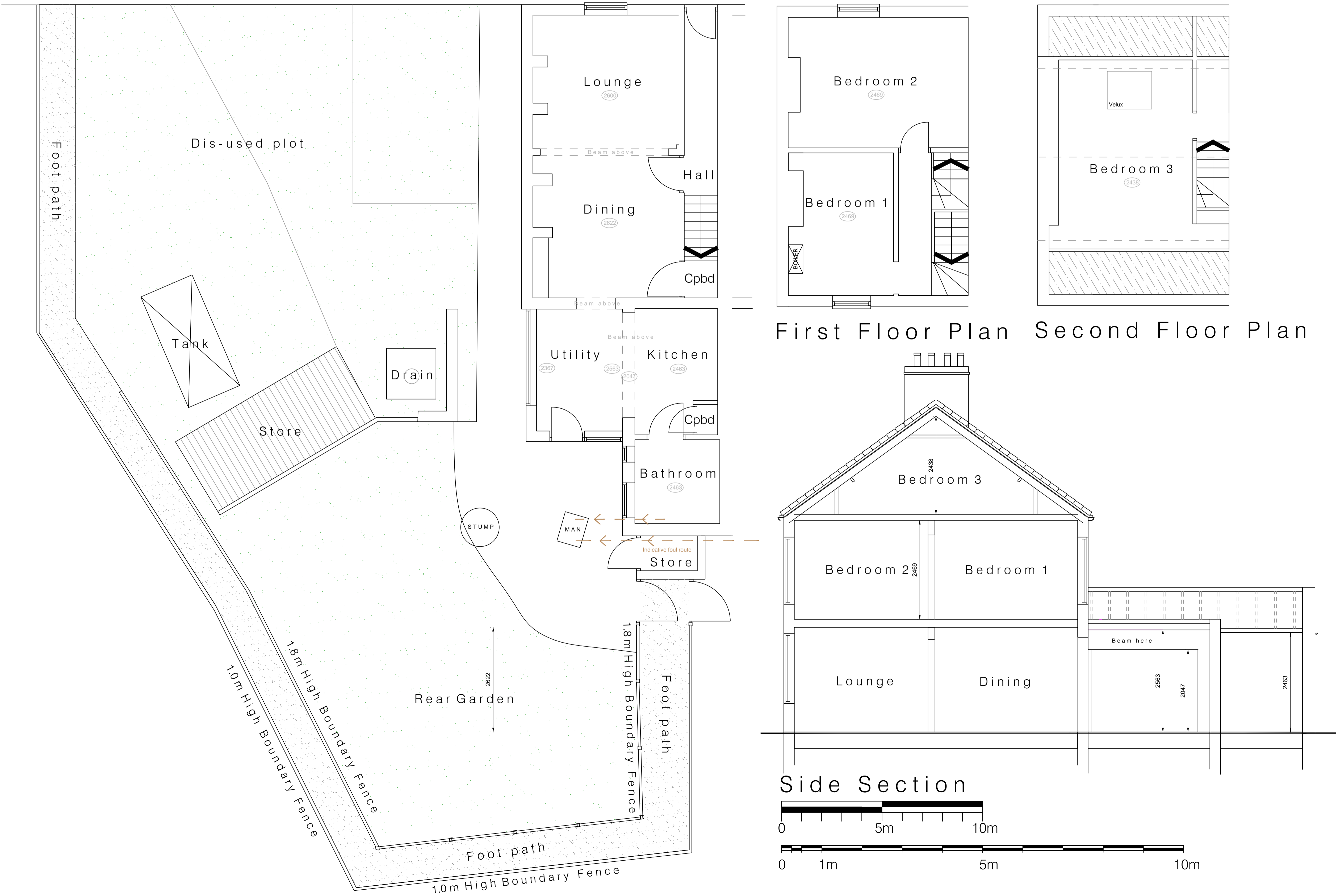
First Floor Plan Second Floor Plan