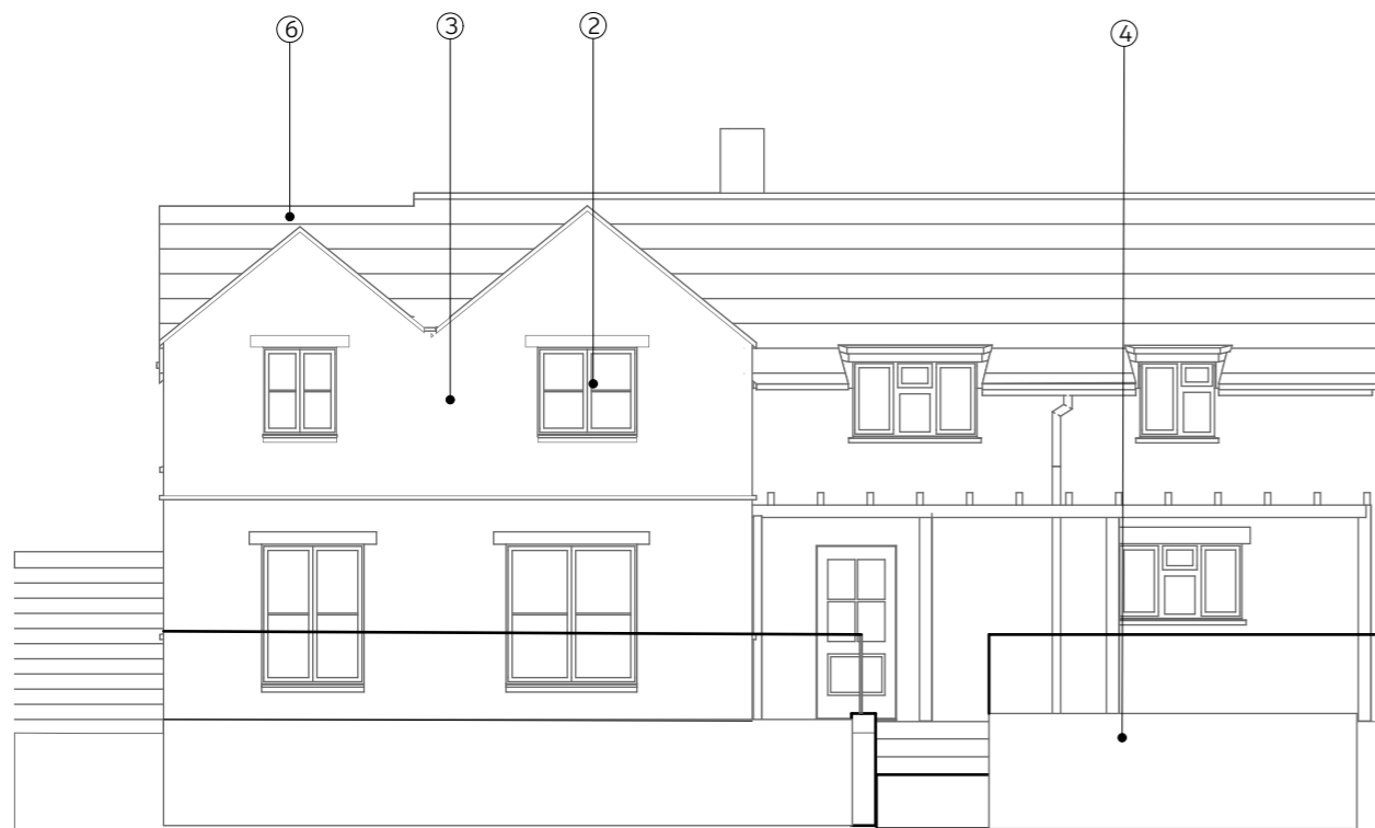
1:100 PROPOSED REAR ELEVATION