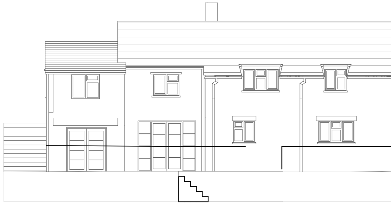
1:100 EXISTING REAR ELEVATION