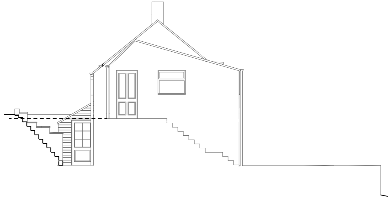
1:100 EXISTING NW SIDE ELEVATION