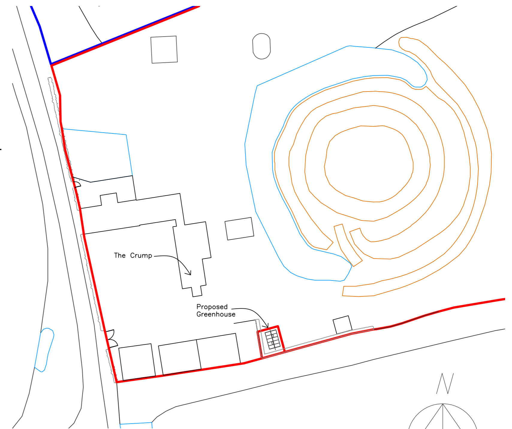
Proposed Block Plan 1:500