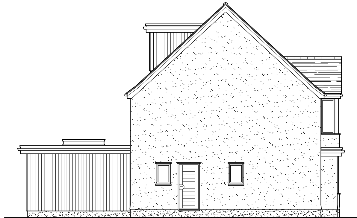
Proposed Side Elevation - 1:100

Andrew Stevenson Associates ARCHITECTURAL & BUILDING SURVEYING SERVICES