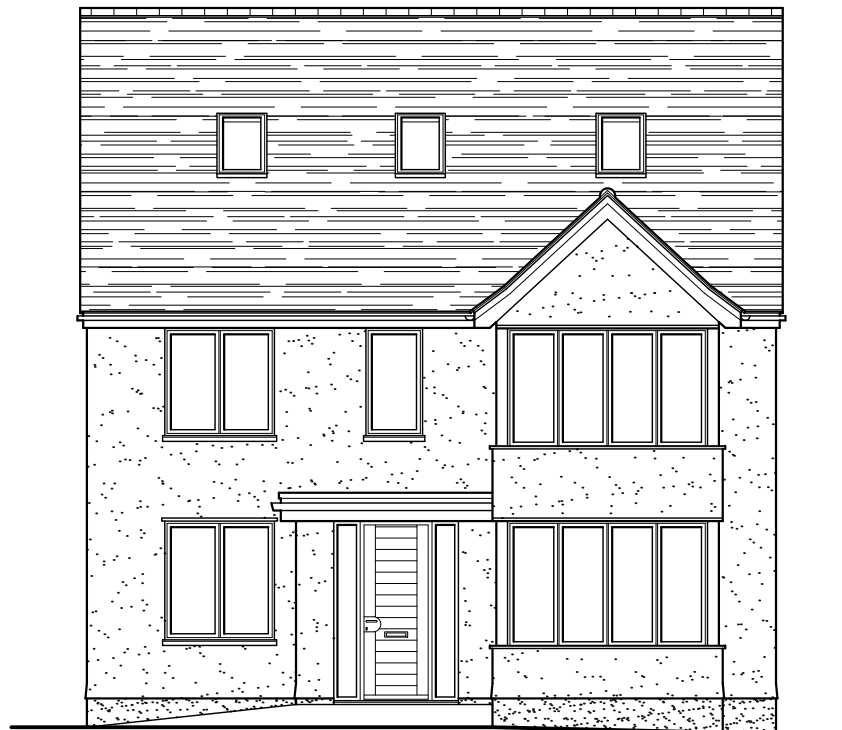
Proposed Front Elevation - 1:100