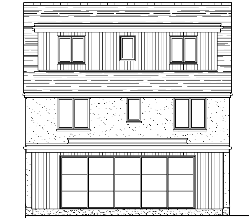
Proposed Rear Elevation - 1:100