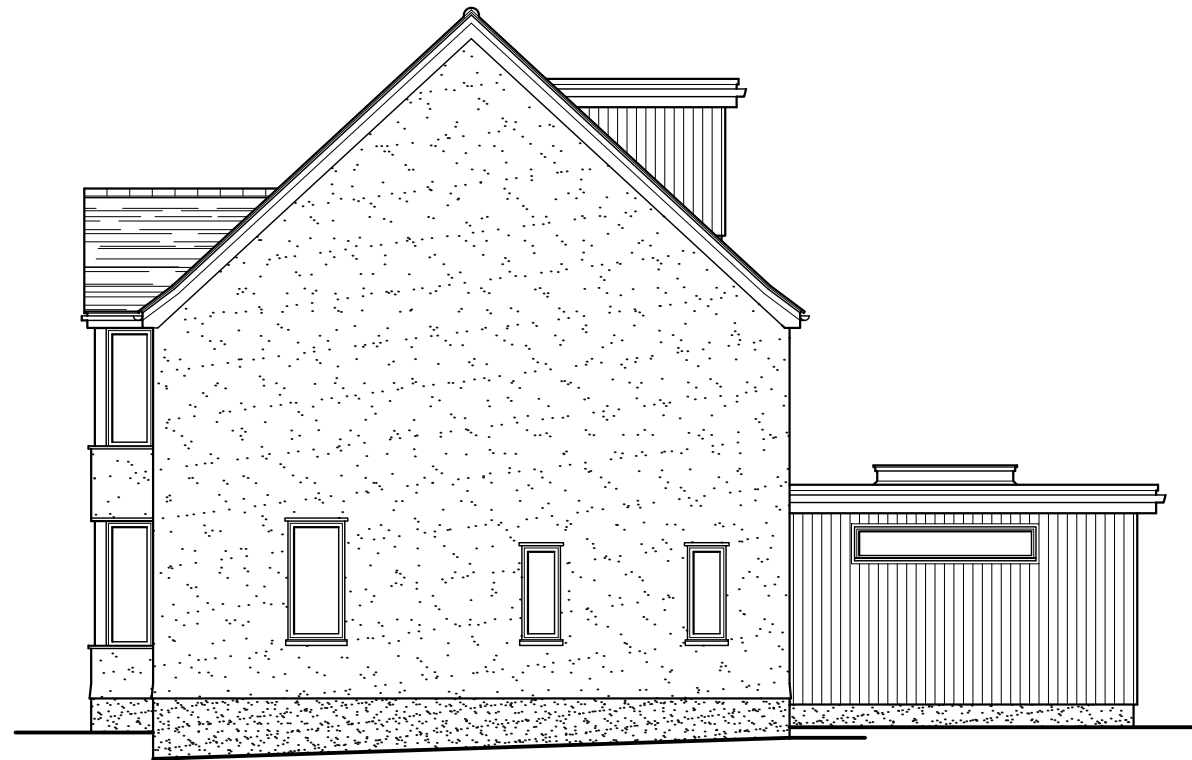
Proposed Side Elevation - 1:100