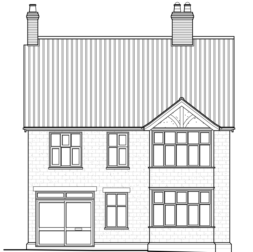
Existing Front Elevation - 1:100