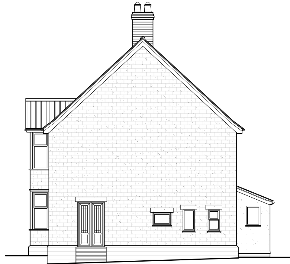
Existing Side Elevation - 1:100