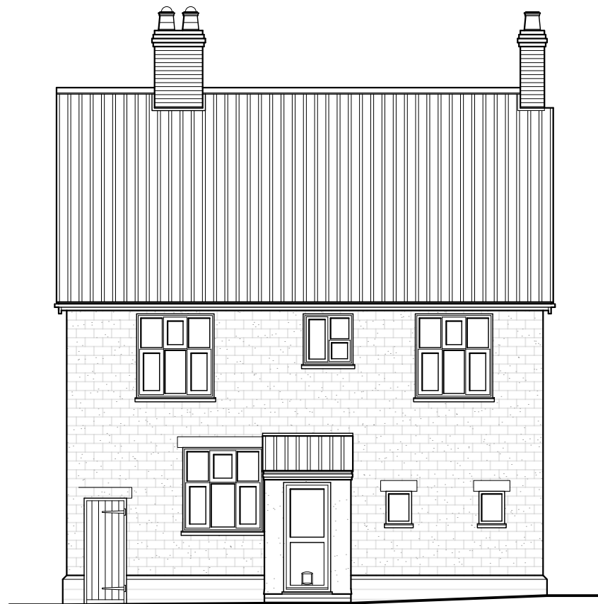
Existing Rear Elevation - 1:100