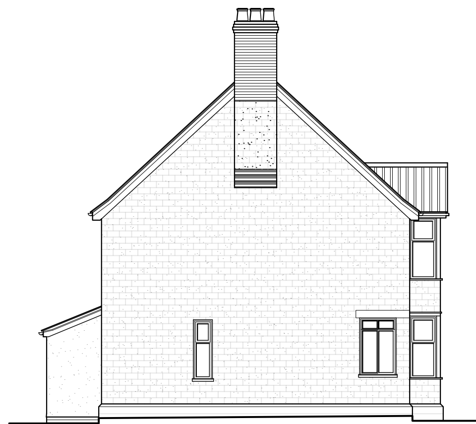
Existing Side Elevation - 1:100

Andrew Stevenson Associates ARCHITECTURAL & BUILDING SURVEYING SERVICES