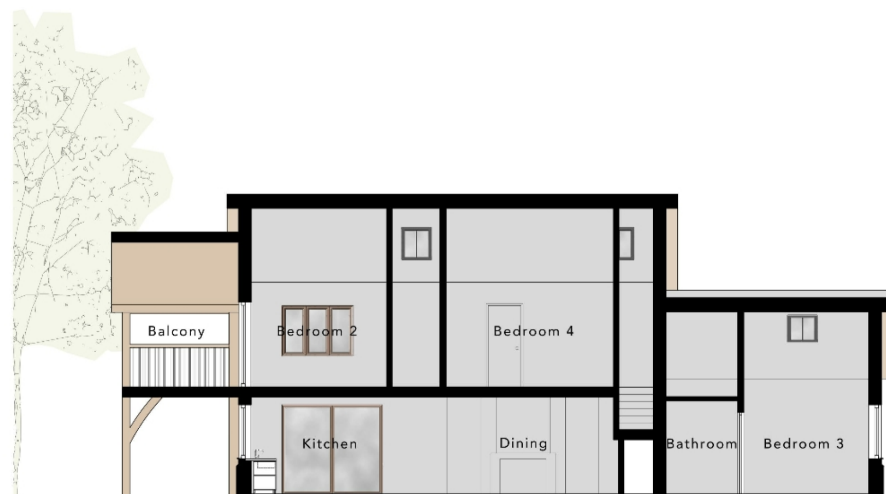
Section AA' 1:100 @ A1

Ridge +7.850m Eaves +5.300m Ridge Garage +5.050m Level 1 +2.900m Eaves Garage +2.500m Level 0 +0.150m Ground Level +0.000m