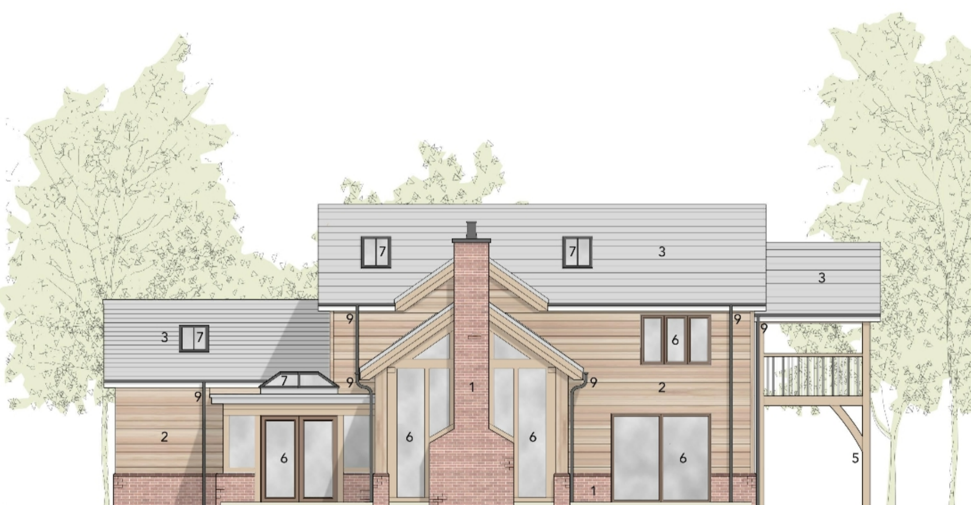
North Elevation 1:100 @ A1