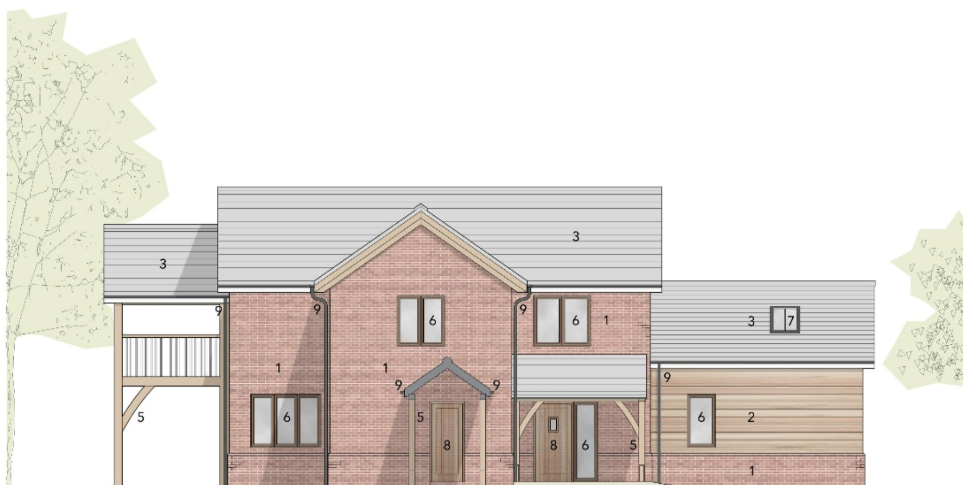
South Elevation - Without garage in foreground 1:100 @ A1