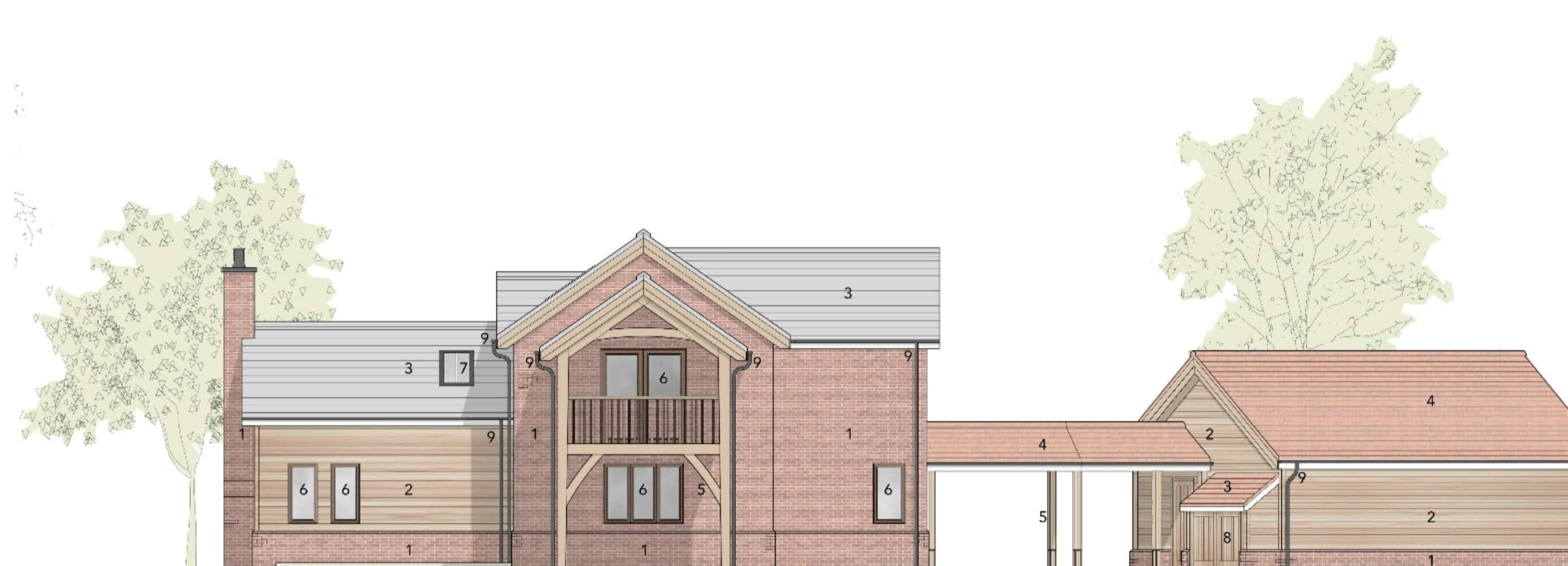
West Elevation 1:100 @ A1

Ridge +7.850m Eaves +5.300m Ridge Garage +5.050m Level 1 +2.900m Eaves Garage +2.500m Level 0 +0.150m Ground Level +0.000m