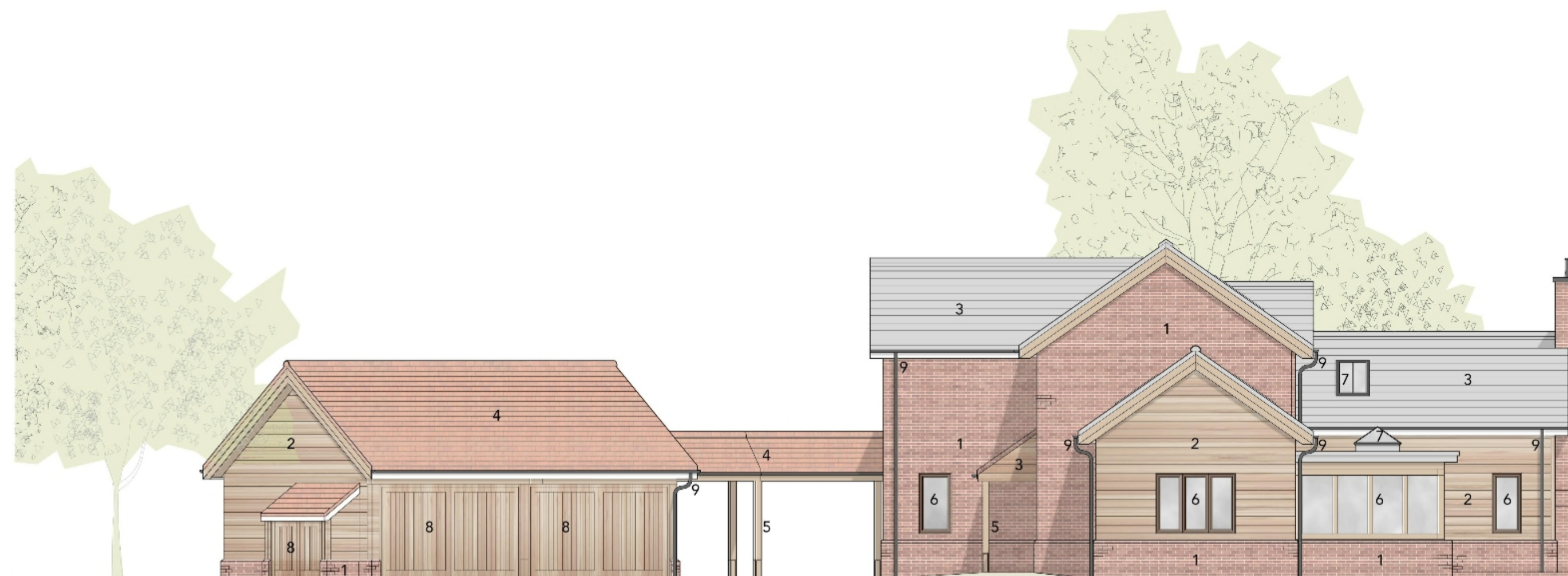
East Elevation 1:100 @ A1

Ridge +7.850m Eaves +5.300m Ridge Garage +5.050m Level 1 +2.900m Eaves Garage +2.500m Level 0 +0.150m Ground Level +0.000m