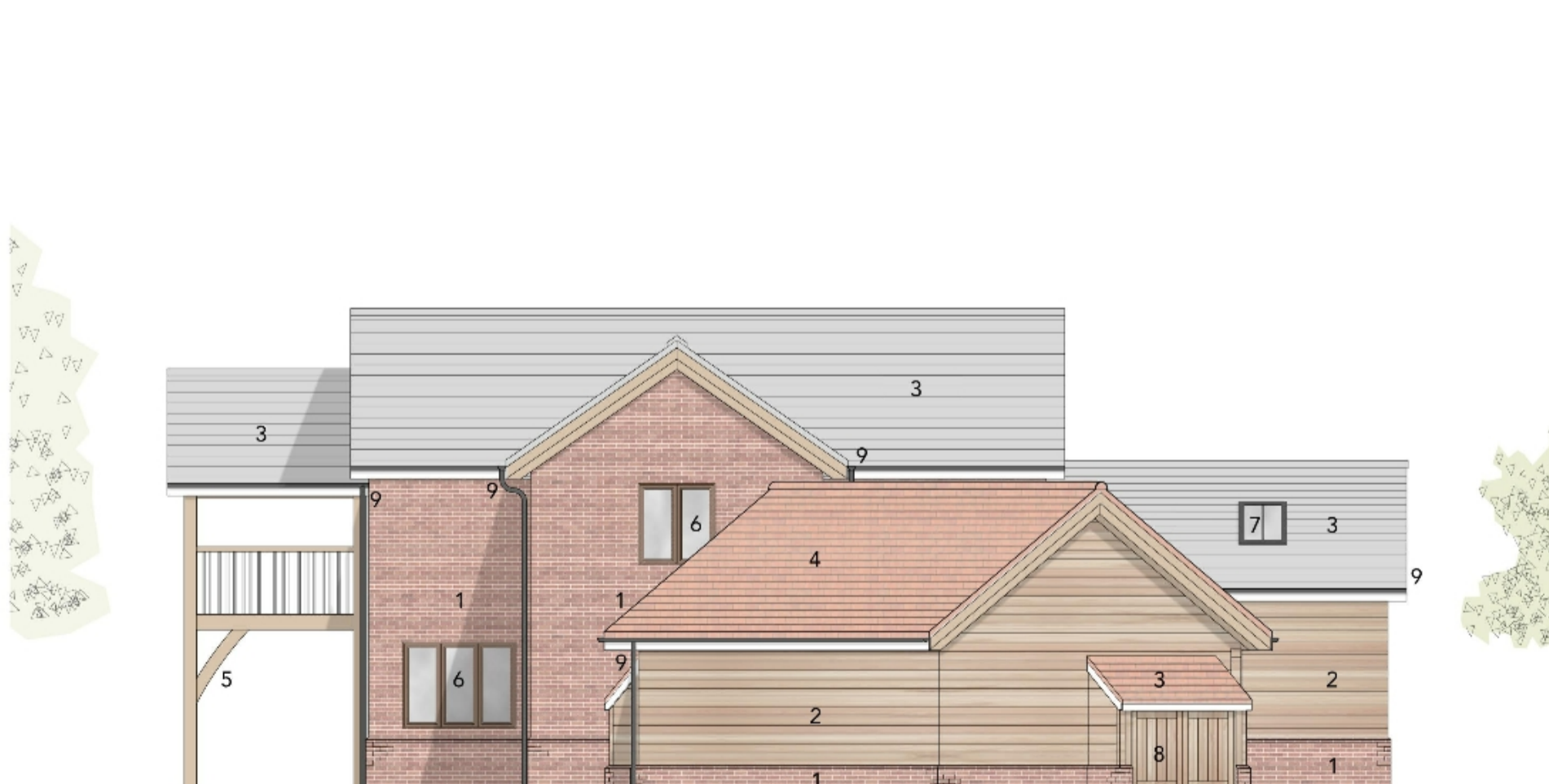
South Elevation - With garage in foreground 1:100 @ A1