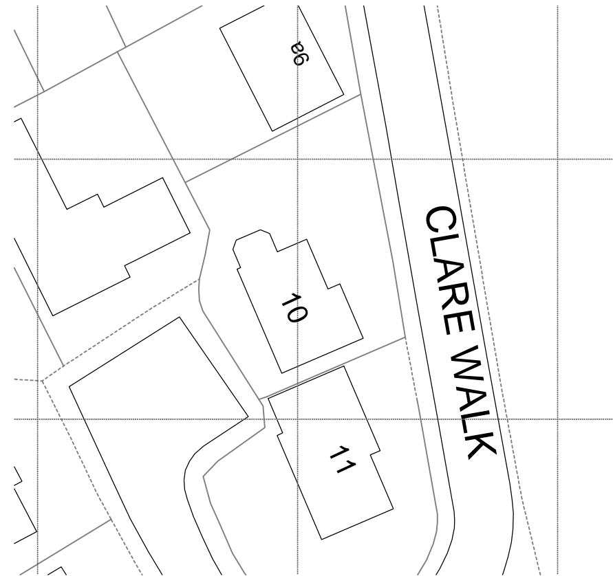
Existing Block plan 1:500

01 All drawings are preliminary unless stated differently. Preliminary drawings are not to be built or manufactured from. 02 This drawing is subject to copyright of TNI Building Designs. Reproduction only with written authority. 03 All structural work where mentioned on this drawing is subject to a qualified structural and civil engineer calculations. 04 These plans may be subject to "Planning & Building Regulation Approval" or any other statute in law. 05 All materials to match existing unless otherwise stated. 06 This drawing is indicative and is not a structural engineering drawing. Designs by client.