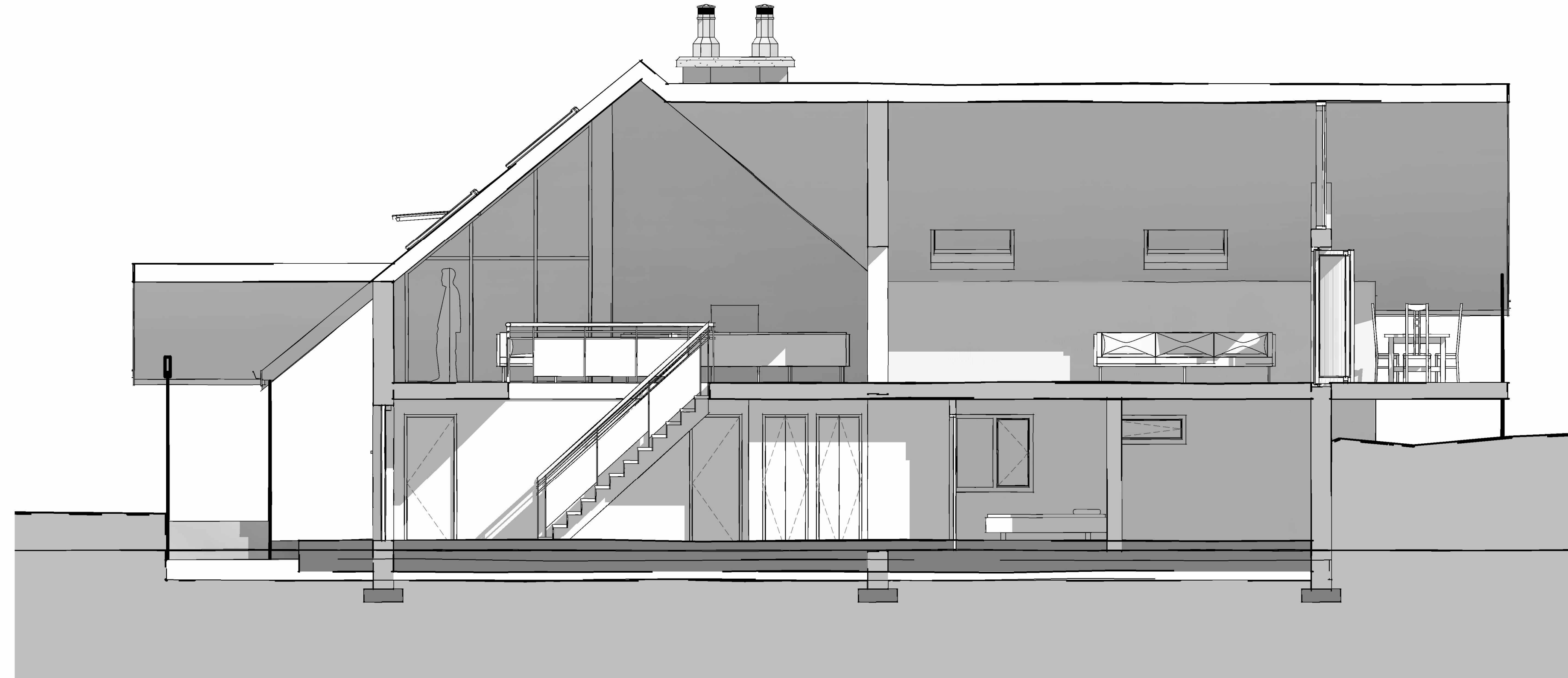
4 Section A-A 1 : 50