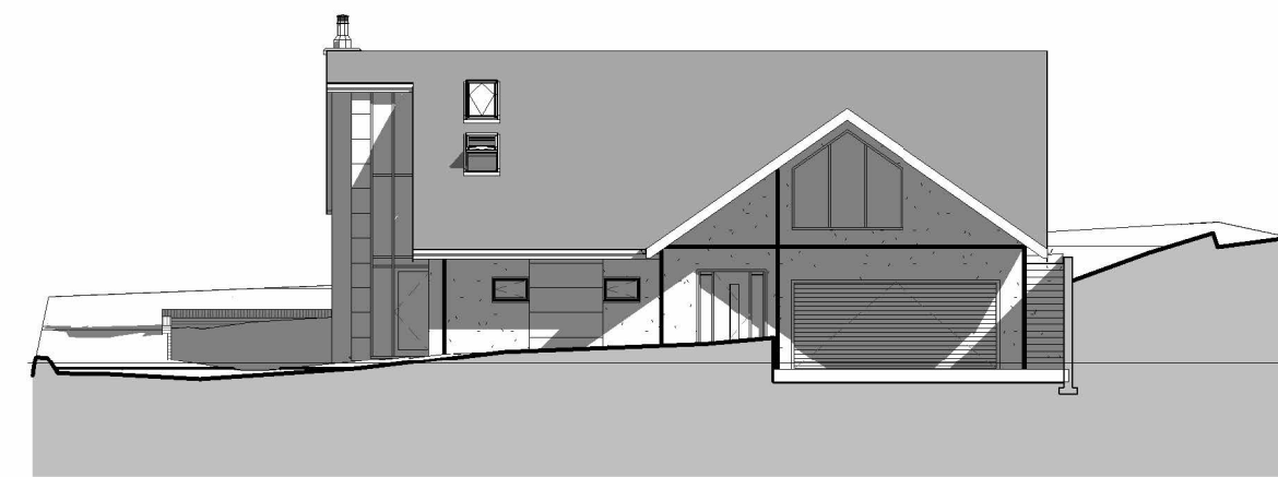
3 Site Section 3 1 : 200