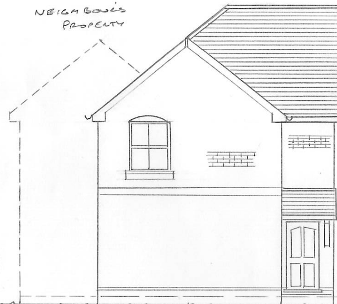
EXISTING SIDE ELEVATION (1)