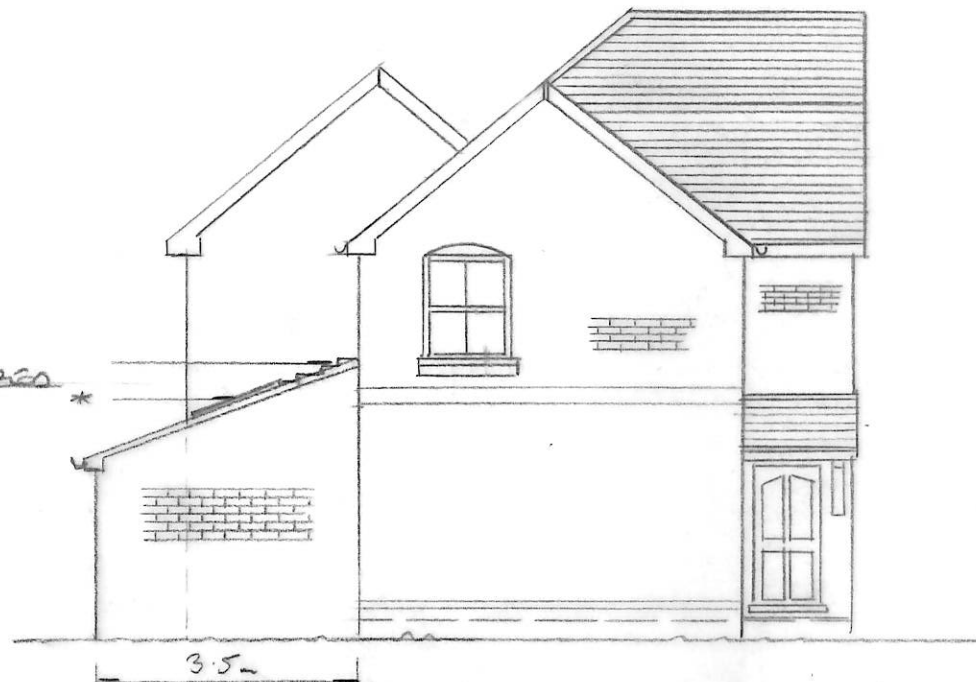
PROPOSED SIDE ELEVATION (1)

* NO GAP BETWEEN WALL + NEW ROOF. STEEPED FLASHING REQUIRED *