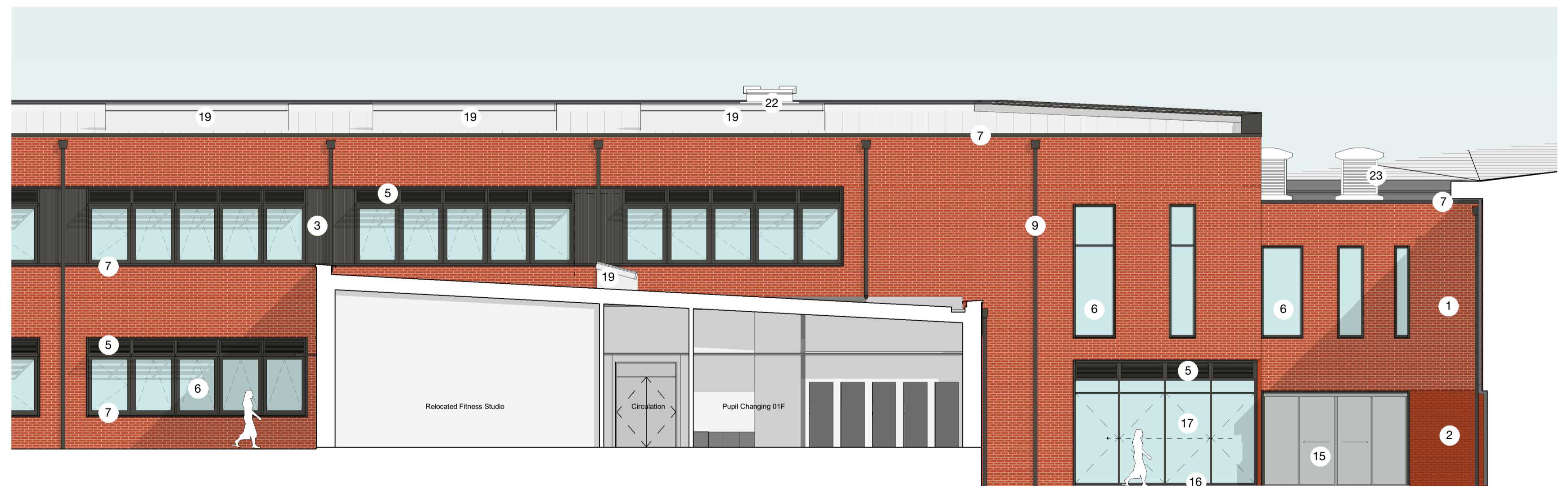
F2 Teaching Wing - East Elevation (Part 2) 1 : 100

BUILDING DESIGN PARTNERSHIP SHALL HAVE NO RESPONSIBILITY FOR ANY USE MADE OF THIS DOCUMENT OTHER THAN FOR THAT WHICH IT WAS PREPARED AND ISSUED. ALL DIMENSIONS SHOULD BE CHECKED ON SITE. DO NOT SCALE FROM THIS DRAWING. ANY DRAWING ERRORS OR DIVERGENCIES SHOULD BE BROUGHT TO THE ATTENTION OF BUILDING DESIGN PARTNERSHIP AT THE ADDRESS SHOWN BELOW. DRAWINGS SHALL BE READ IN CONJUNCTION WITH THE FOLLOWING BEFORE WORK COMMENCES: • THE COM DESIGN ISSUES REGISTER • THE BDP RISK SERIES OF DRAWINGS • THE PROJECT COM RISK REGISTER