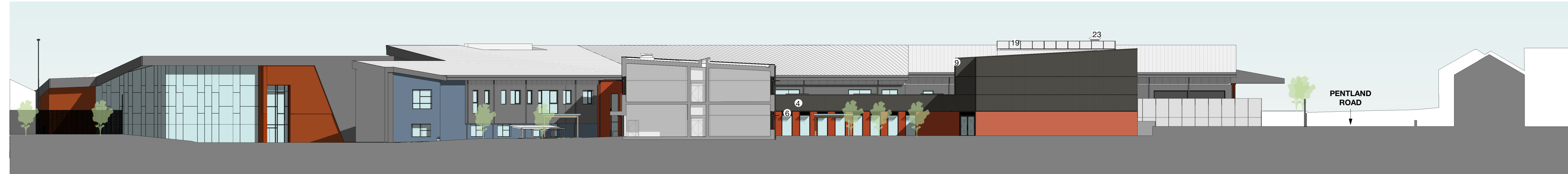
DD 05. Proposed South Elevation 3/3 1 : 250