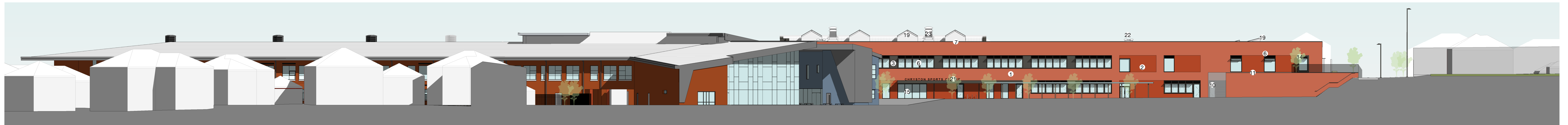
FF 06. Proposed West Elevation 1 : 250