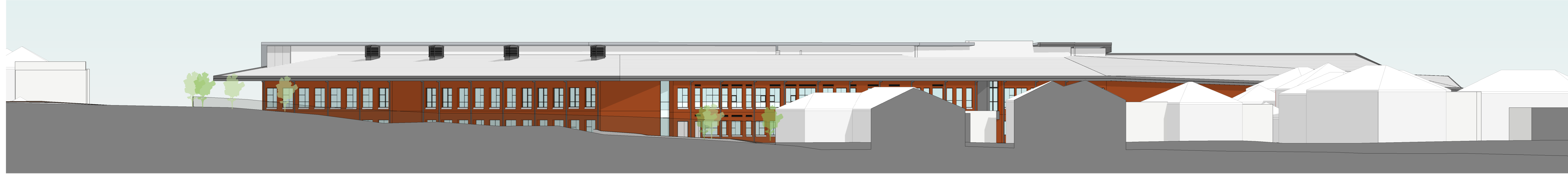
BB 02. Proposed North Elevation 1 : 250