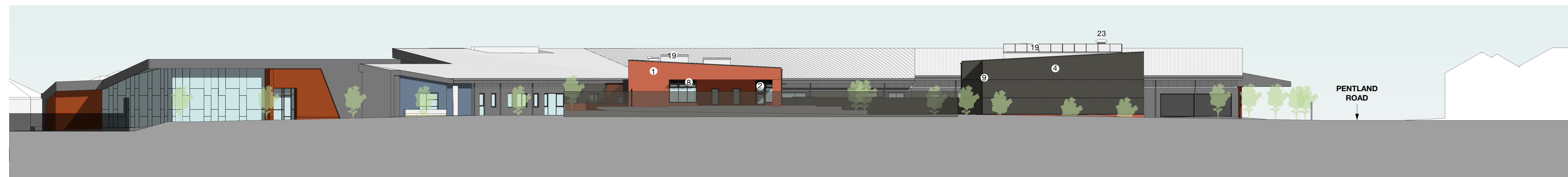
EE 04. Proposed South Elevation 2/3 1 : 250