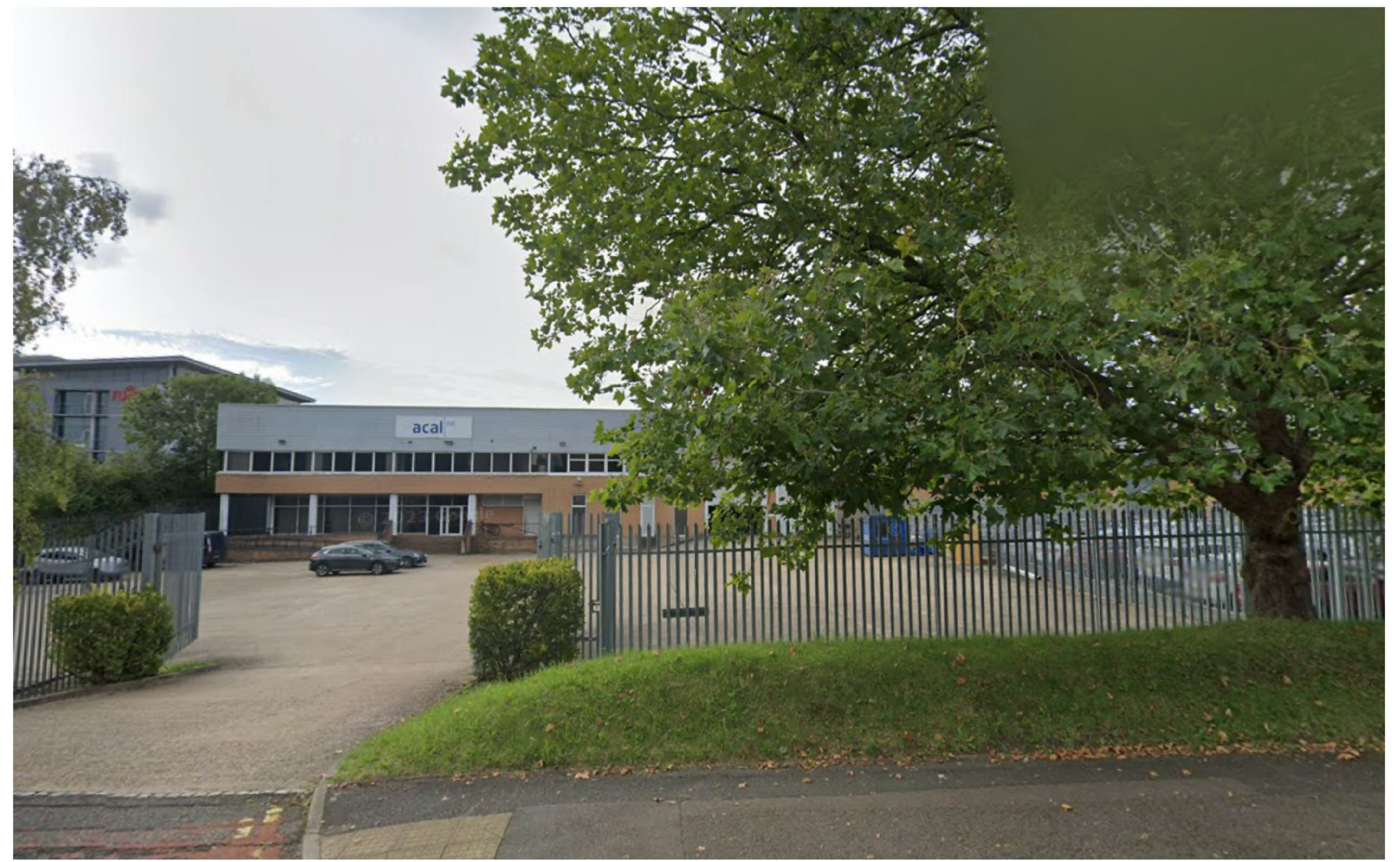
2. EXISTING ELEVATION (FROM CAR PARK)