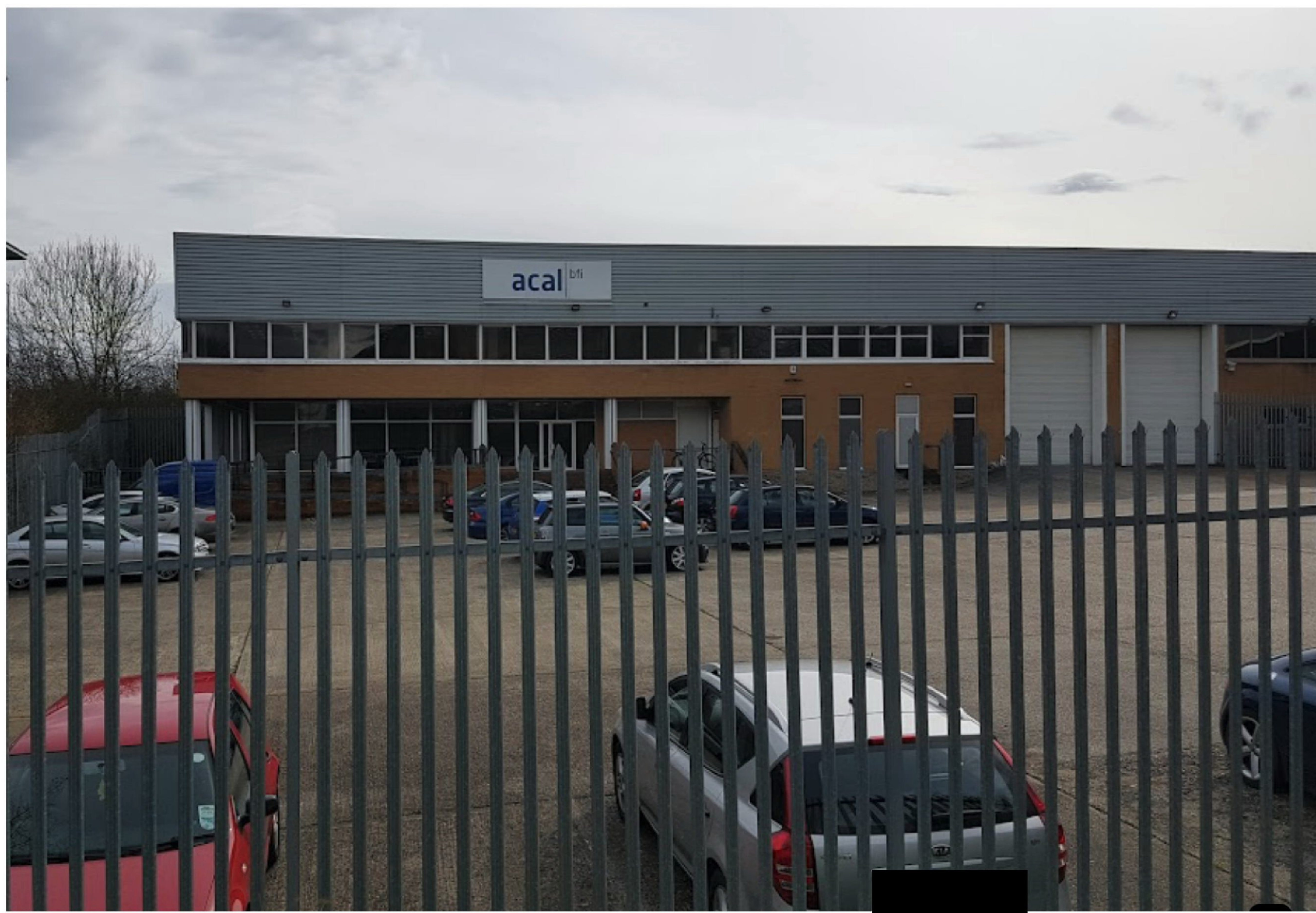
1. EXISTING ELEVATION (FROM CAR PARK)