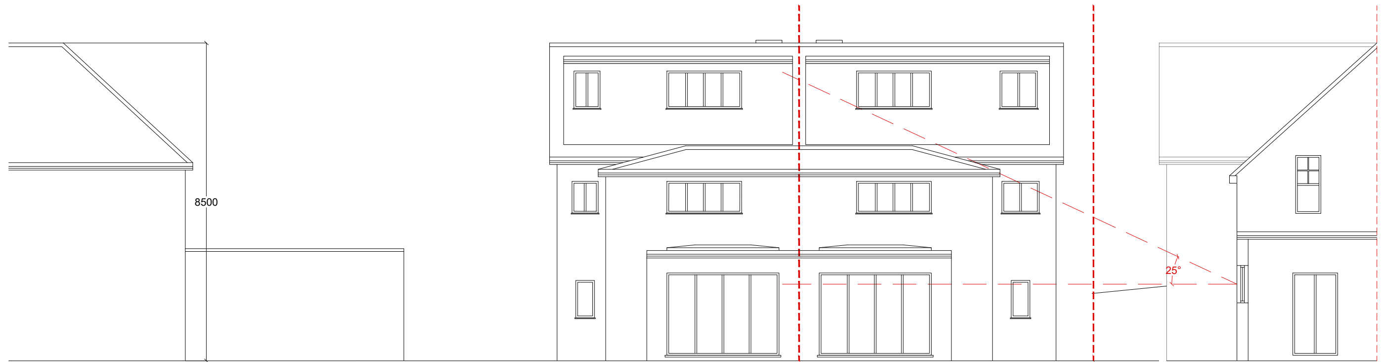
REAR ELEVATION SCENE - 25° LINE COMPARISON SCALE 1:100