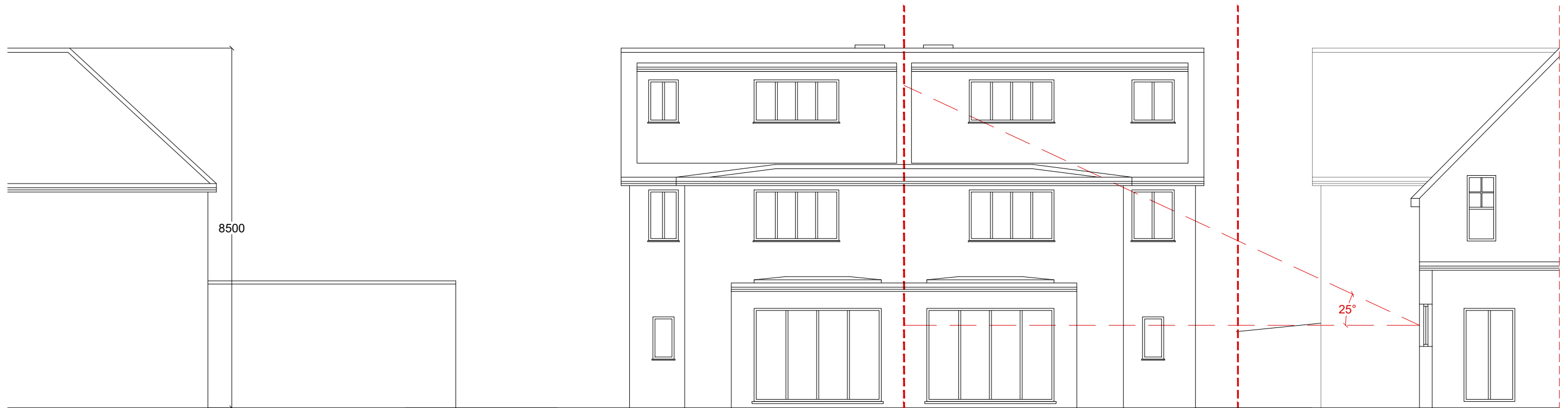
REAR ELEVATION SCENE - 25° LINE COMPARISON SCALE 1:100