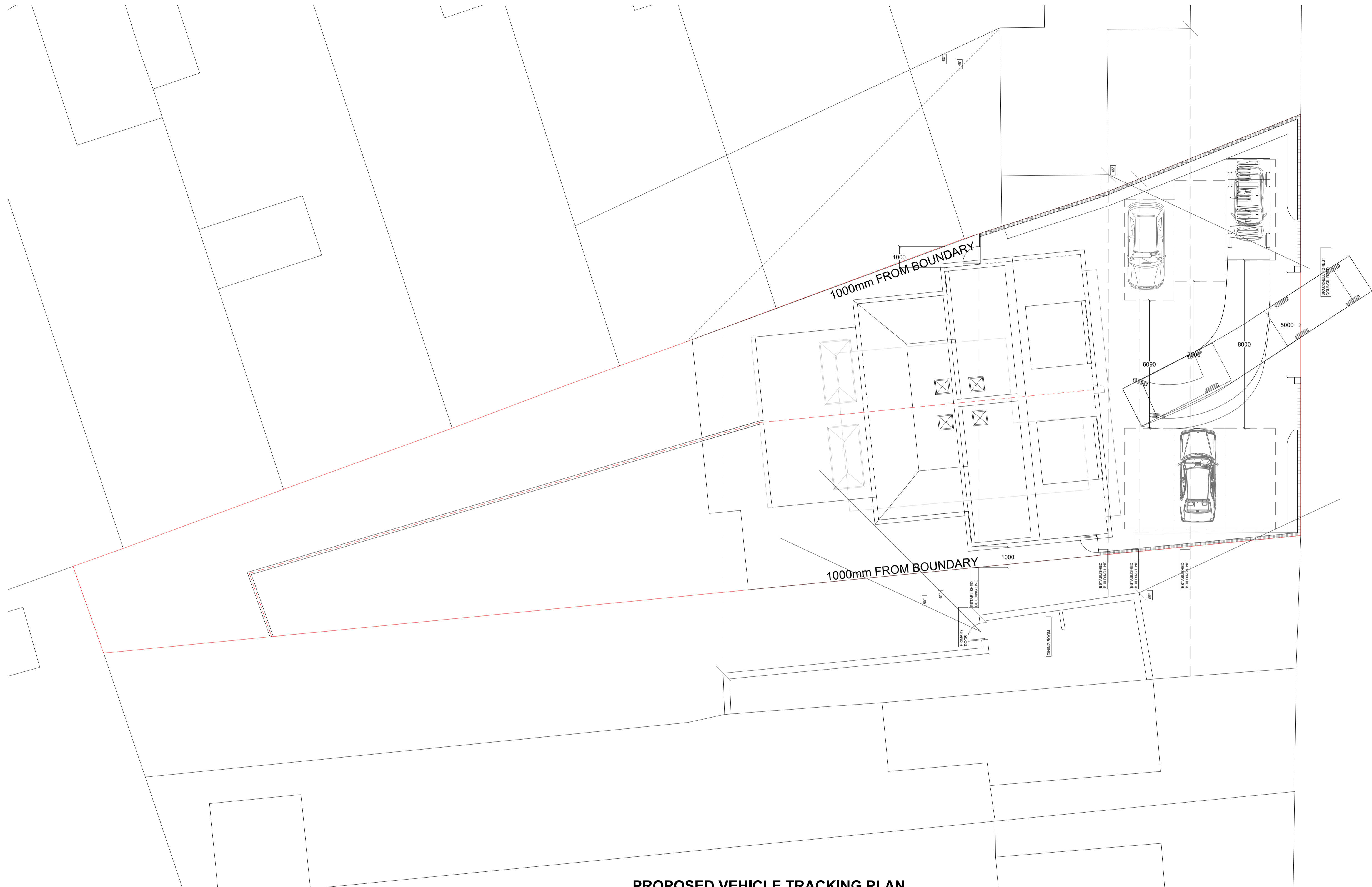
PROPOSED VEHICLE TRACKING PLAN SCALE 1:100