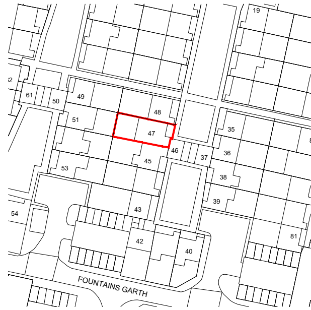
Site Location Plan Ordnance Survey 100053143