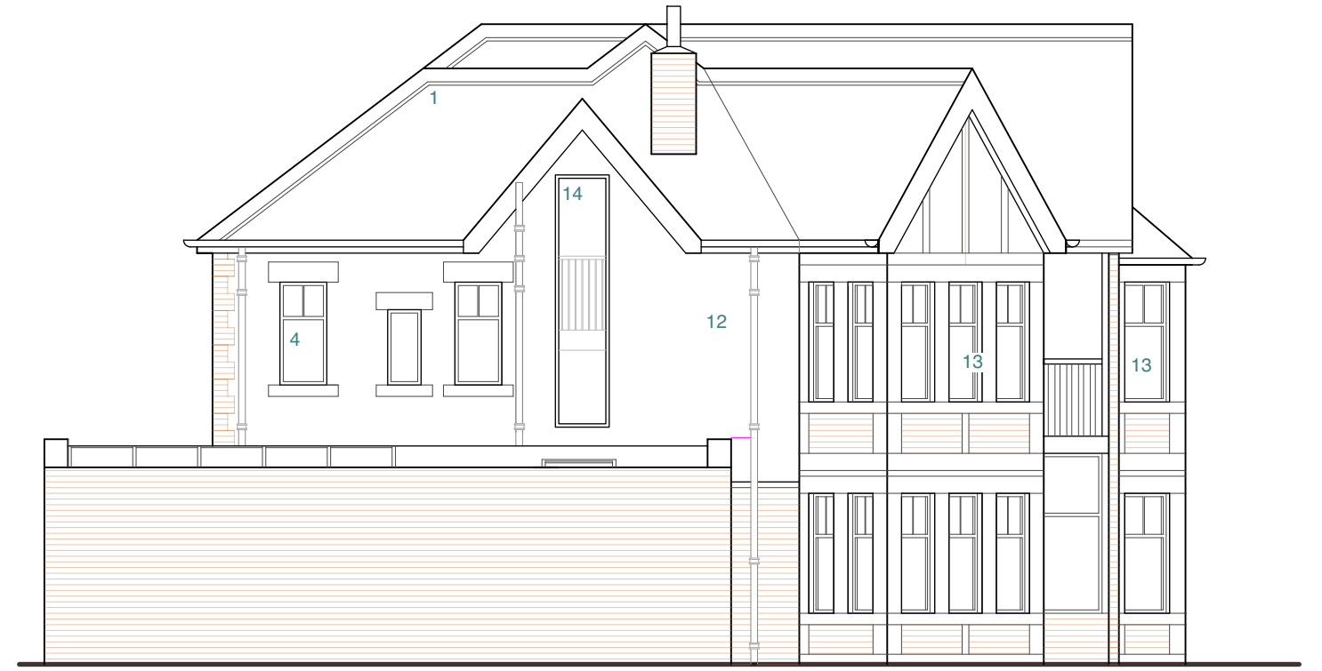
E12.2 Existing South West Elevation