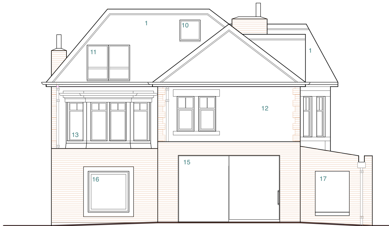
E12.3 Existing North West Elevation