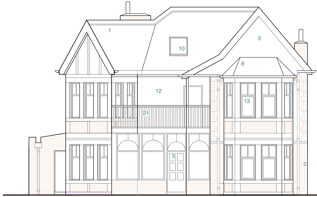
E12.1 Existing South East Elevation