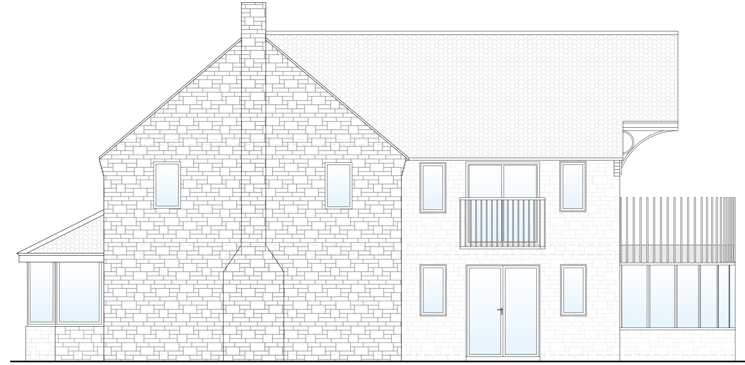
Existing Northeast (Side) Elevation Scale 1:50