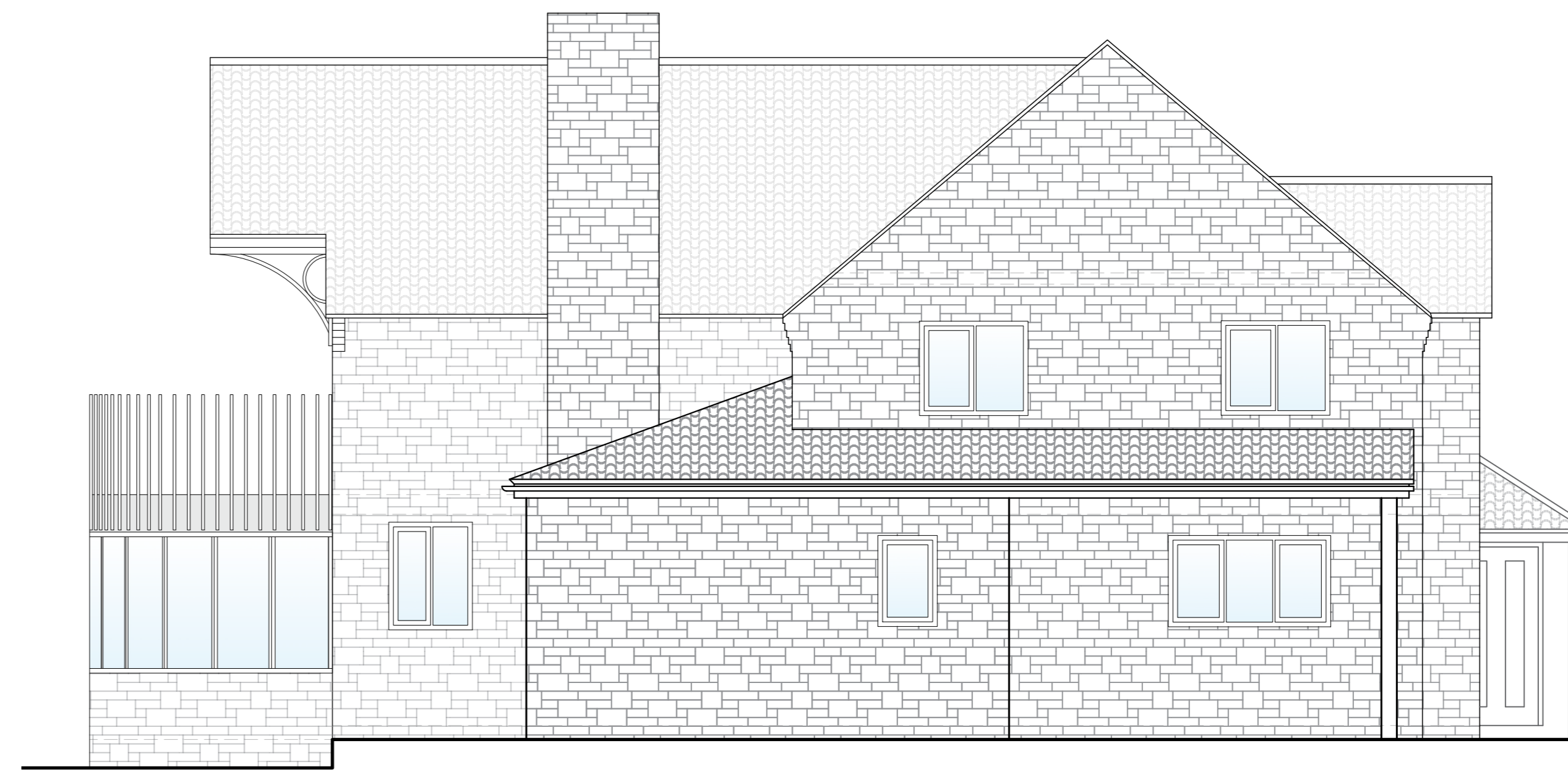
Existing Southwest (Side) Elevation Scale 1:50