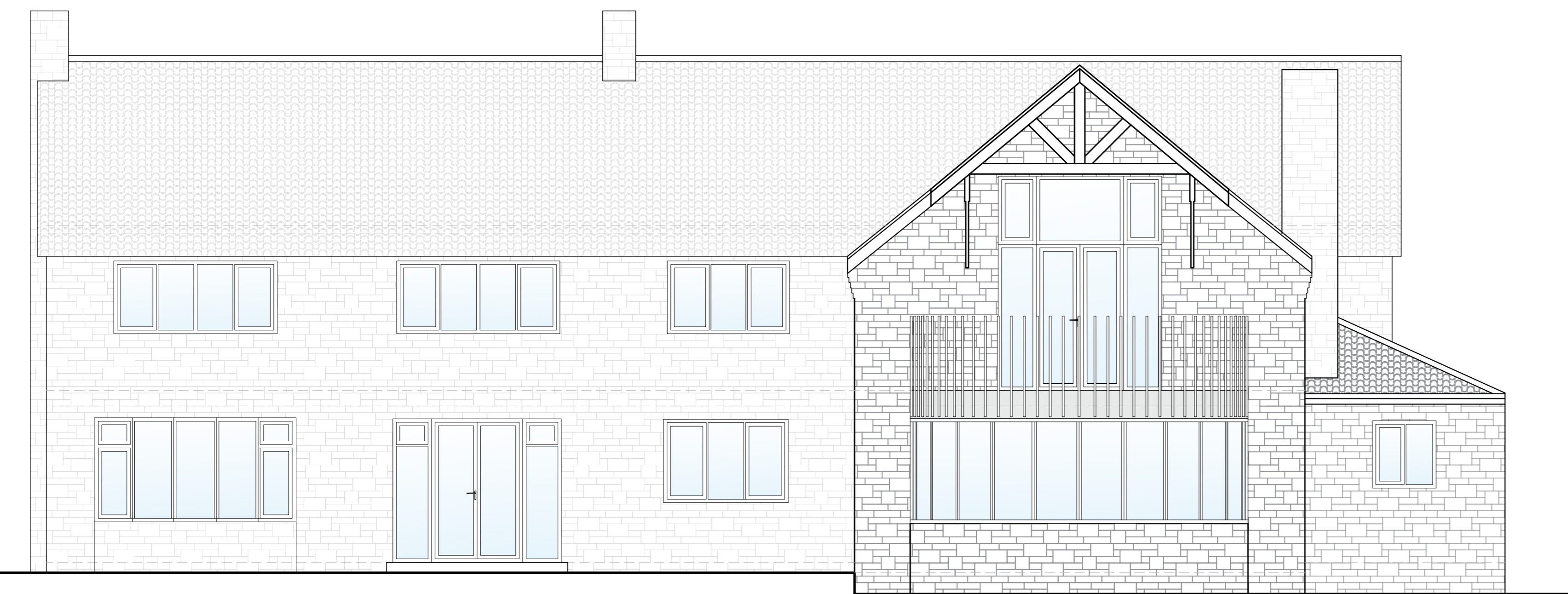
Existing Northwest (Rear) Elevation Scale 1:50