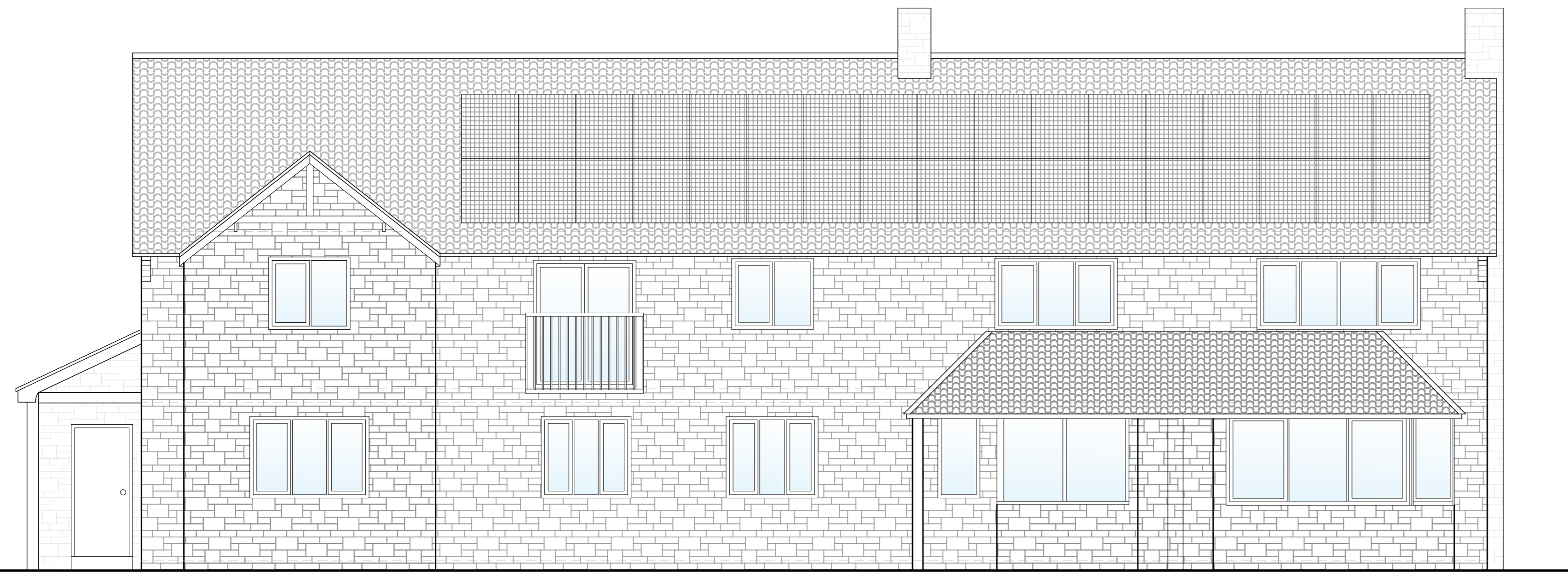
Existing Southwest (Front) Elevation Scale 1:50